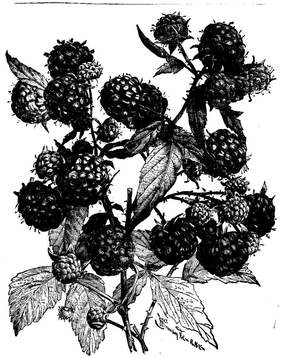
SHAFFER'S COLOSSAL RASPBERRY.

now, (July 29th), with a prospect of | with fifty berries on one shoot, and such berries for a month to come. Not berries—an inch in diameter. The fruit