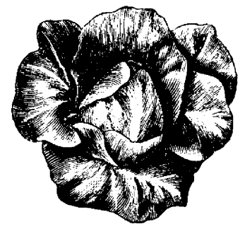
EARLY JERSEY WAKEFIELD.

I sow the seed of the kinds I wish to grow in February or first of March, in small shallow boxes in forcing pit, hotbed, or if these are not to be had, a sunny window of the house will do. The boxes I use are eighteen by twenty-four inches, three inches deep; made of one-half inch boards. The kinds of early cabbage I generally raise are Early