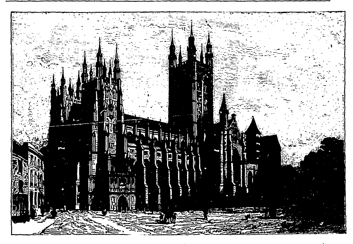
CANTERBURY CATHEDRAL, ENGLAND. (See page 248.)

the Church receive as little harm as possible. He would encourage them when dispirited, cheer them when wearied, and stand by them when falsely accused. He would be the friend of every one of his clergy; their confidant in whatever difficulties might arise; for he would feel that while he himself was the pastor pastorum, the whole flock in his diocese was really his charge, and that the priests and deacons in their respective spheres were executing their ministry as his vicars in those special duties to which they were ordained. He would feel that their work was his work, and that his duty in a parish was only begun when he came to confirm. the young. He would fix upon new centres of work, and never leave one unoccupied. There is more than we are familiar with in the true idea of the episcopal office; but it is not possible to carry out this idea unless the office is widely extended on the primitive model.