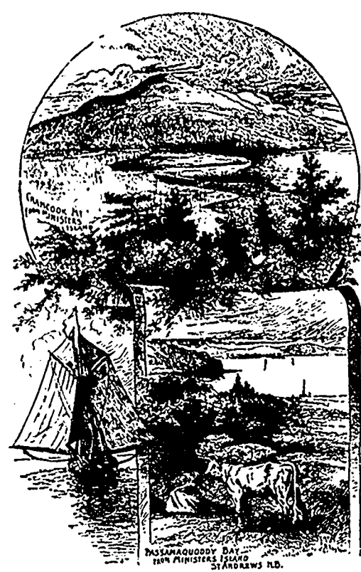
SCENE IN ST. ANDREWS (N.B.) PARISH. (See page 251.)

centuries, the kaleidoscopic changes of the last thirty years in Japan have been wonderful. . For a few years during that period the people seemed to fix some attention on religion, but it was distracted by political excitement. And now those who thirty years ago were practically slaves are either in possession of the franchise or clamoring for it. Every one seems to think he has now reached a rank where nothing is impossible. All are on the qui vive for the next move in the political field. And at the same time a nation, until now very poor. has entered madly into the race for riches. People's minds are so absorbed with political changes and with striving after wealth and position that religion is altogether overlooked. Christianity, Buddhism, and Shintoism are almost equally disregarded by the general mass. Threatened with complete destruction, Buddhism has of late put forth extraordinary efforts, with the result that it is experiencing in some places a slight revival. But, in general, it seems to be treasured by old women and a portion of the farming class. There are many places, such as Nagano, here where Buddhism, through its large possessions and through its pilgrimages, wields a great secular influence, although its religious power has so much waned.