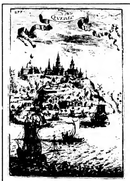
Bibliothèque Nationale du Québec