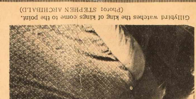
Gillybird watches the king of kings come to the point.