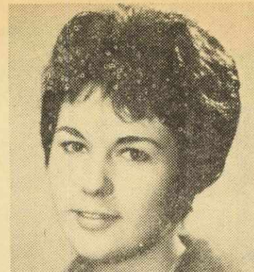
BEAUTY . . . . and the BEAST