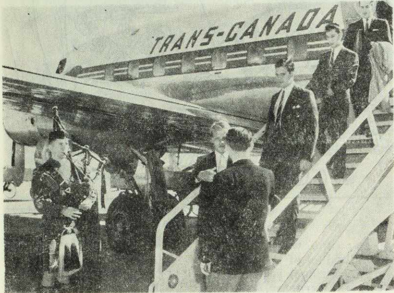
Delegates are piped off the plane at the Halifax International Airport on their arrival to attend the NFCUS Congress.