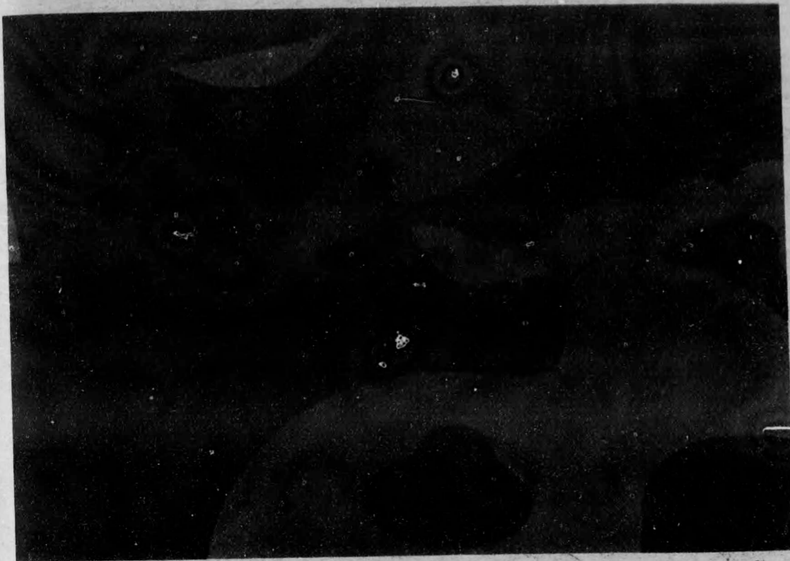
"Women in America are like packaged chicken in a supermarket: nicer to look at than to taste."

A sample of works by the world's most famous pop artists is currently on display at the creative art center.