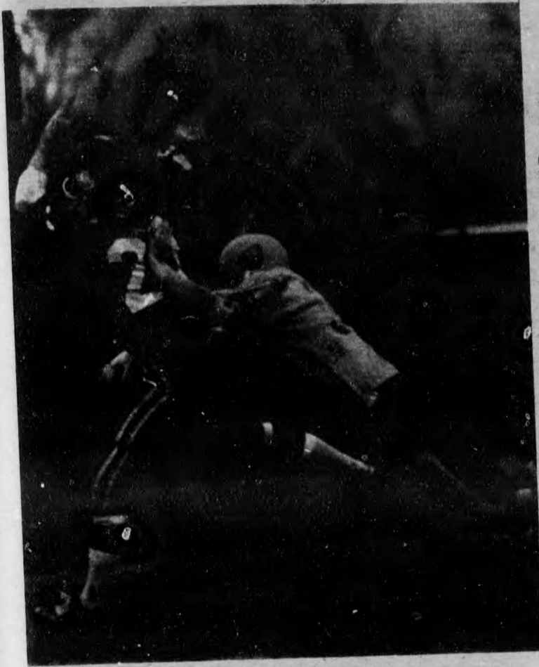
Dan Palov foiled in a rare moment by an unidentified Mount A defender.