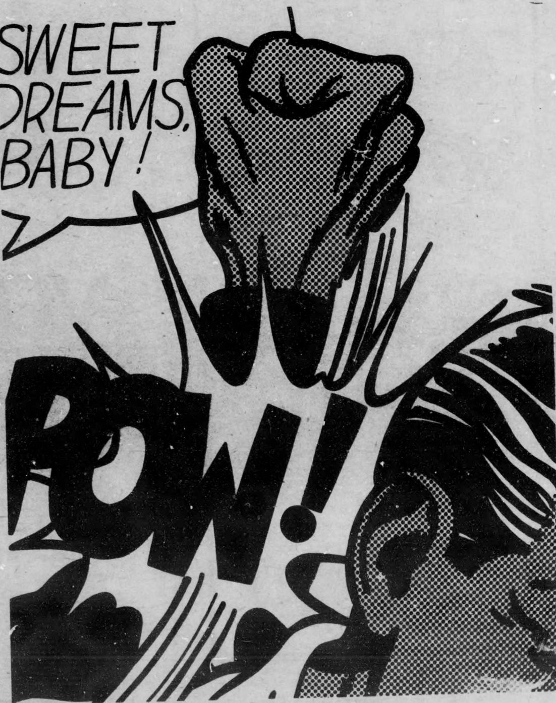
"Sweet dreams, baby!" by Roy. Lichtenstein. In the art center all this week. See page 7.