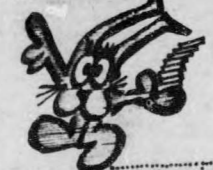
little lappy, showing a propensity for recunosity and velocity simultaneously.

now lappy was short of cash. this isn't surprising, because we would be hard put to advertise this way if she weren't.