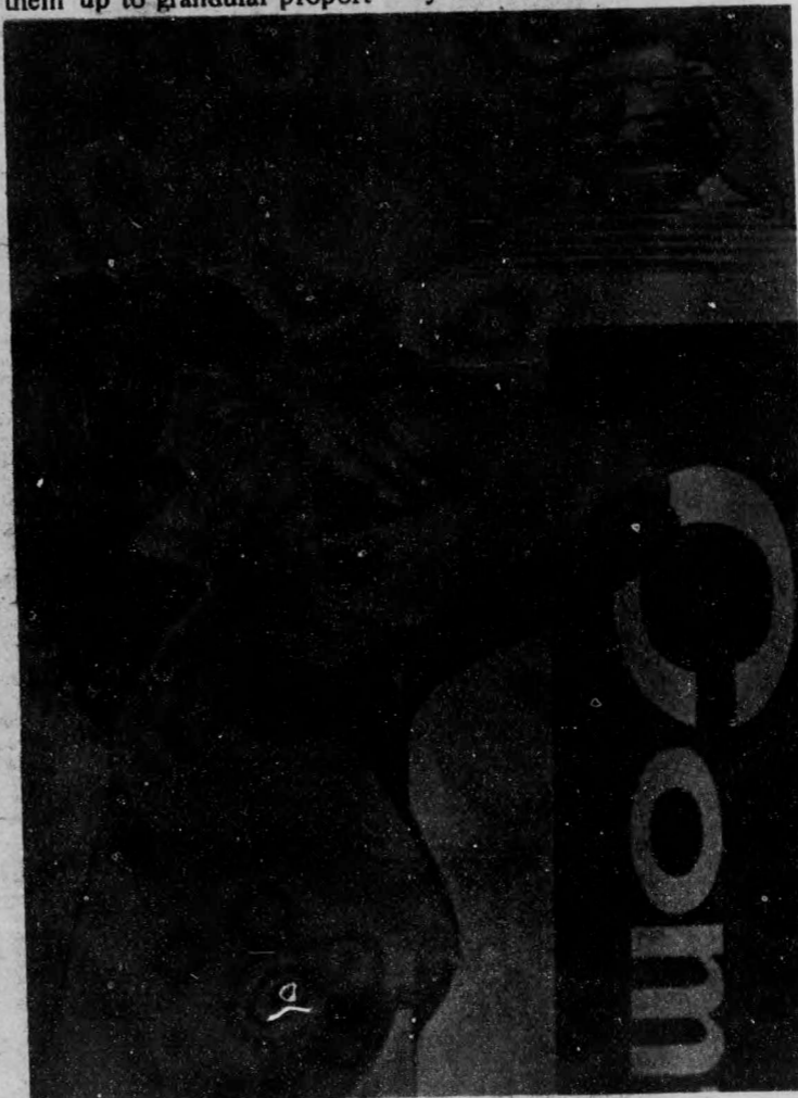
MISS COMFORT CREAM: A reality which no one thought worthy as art subject matter, but a reality which controls our lives."