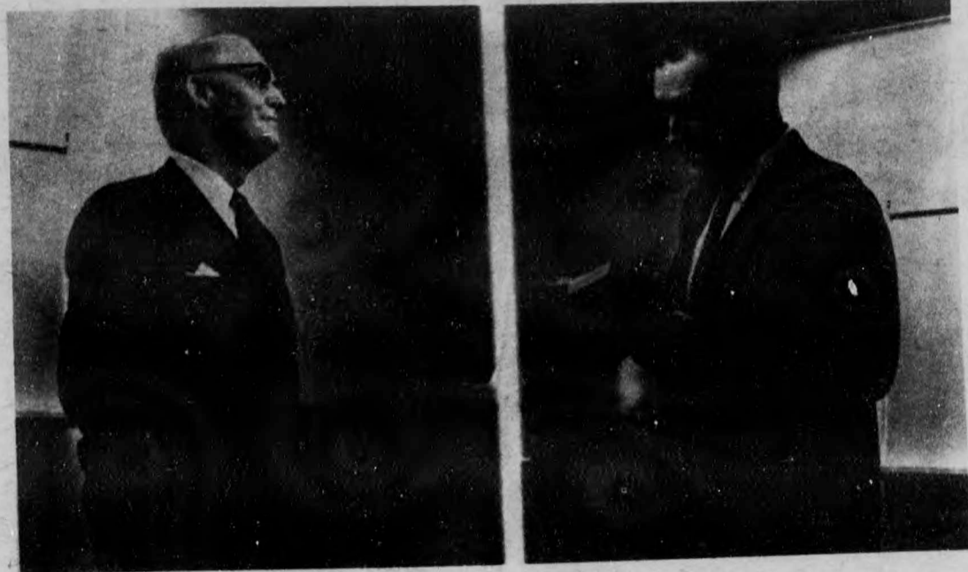
"Putting a bar on a university campus would be just as bad as opening a brothel or a casino." —Berry