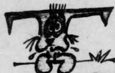
Lapinette, demonstrating her desire for carrotic cupcakeitude.

but such culinary consummations call for capital.