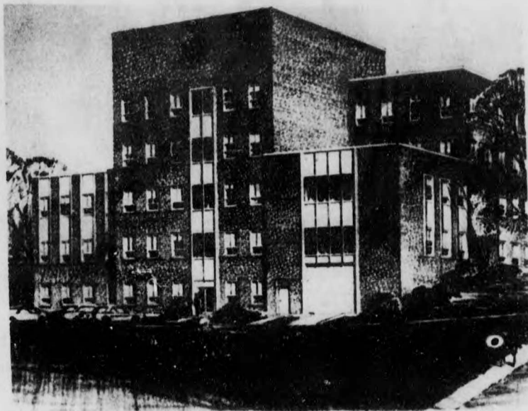
Shown above is the new Engineering Building presently under construction. It is a part of a multi-million dollar expansion program now underway at UNB.

Curtis admitted a large number of the company's work mem-