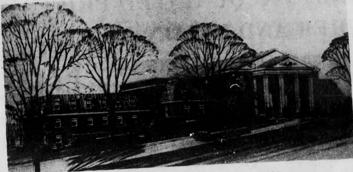
View of South Elevation of new Student Union Building.

After many years of planning and hoping, excavation for the new Student Union Building began early last month. The new building will cost $2,000,000. The cost will be shared by the students and the administration equally. It will be used by the students of UNB, Saint Thomas and Teachers College. Each student at the three institutions pays, as part of his student fees, fifteen dollars a year towards the building fund.