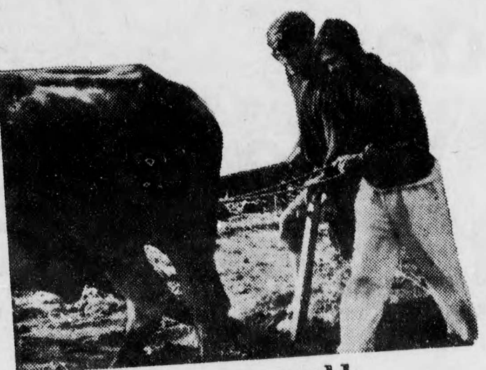
it's your world.

Columbia, Ghana, India, Jamaica, Kenya, Madagascar, Peru, Rwanda, Sarawak, Tanzania, Tchad, Trinidad, Uganda, and Zambia.