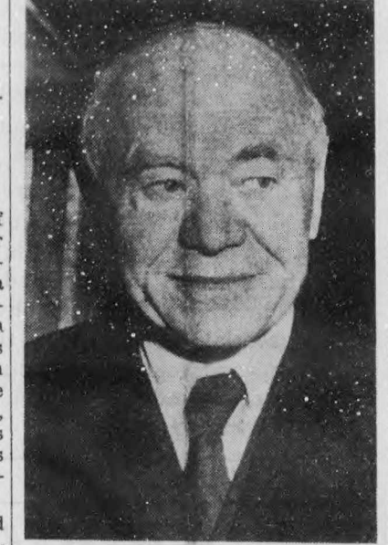
. . . Empire Policy