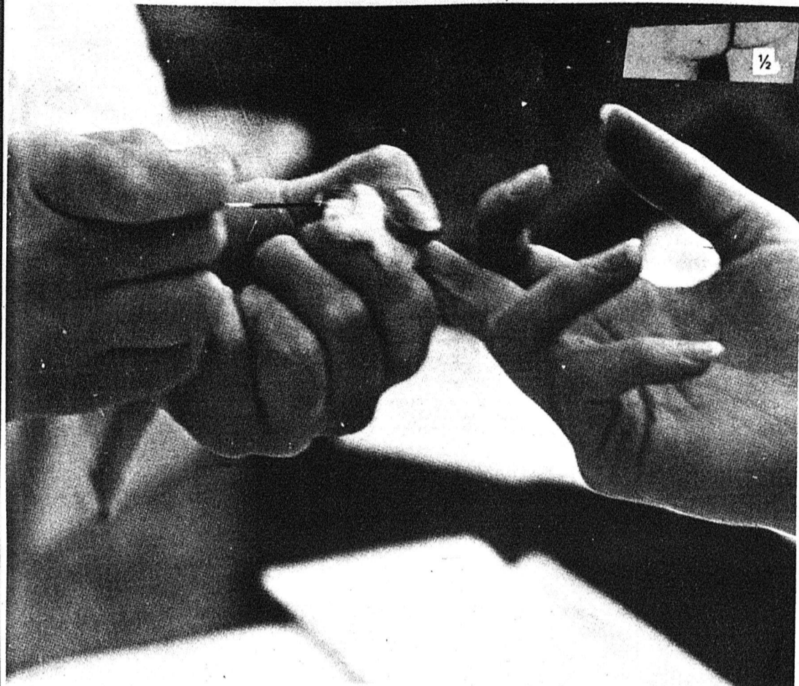
FIRST ANNUAL CLEANLINESS AND GODLINESS ORDER OF RECOGNITION AWARDED TO THE PERSON WHO HAS BEEN ATTACKED MOST OFTEN IN GATEWAY

The winner of this, our first award of this nature, has named himself for this honour elsewhere in this paper. On many occasions we have been blessed with his eminently forgettable ideas in the letters page and in various campaigns for election, most of which, he lost. He has relegated a philosophy that many people share to the level of something about as appealing as a bout with Vietnamese clap.