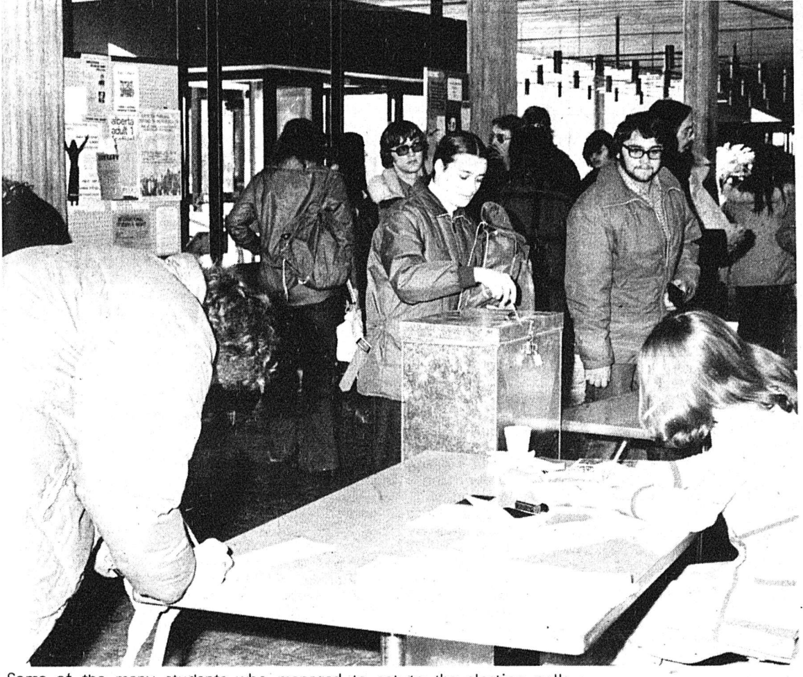
Some of the many students who managed to get to the election polls last Friday. Did you?