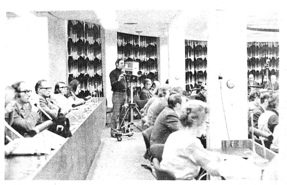
Proceedings of the special tenure debate were telecast to the Board of Governors chambers in University Hall in anticipation of overflow crowds which failed to appear.