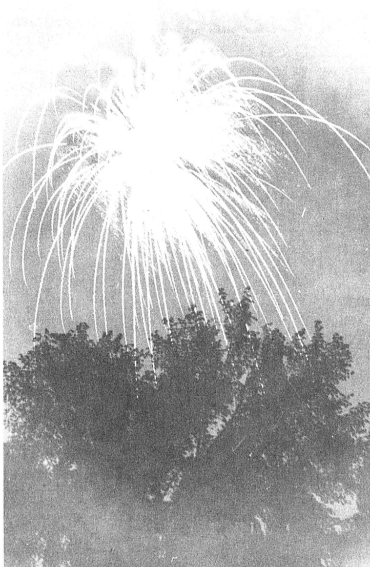
BLAZE OF GLORY ... at the pep rally. A study by Stacey.

Pictures may be taken before the allotted dates for each faculty. BUT, no yearbook photos will be taken after the deadline.