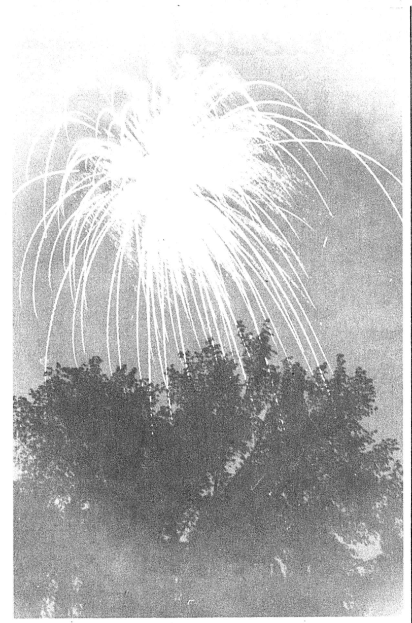
BLAZE OF GLORY ... at the pep rally. A study by Stacey.