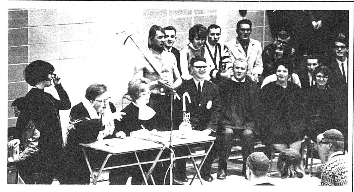
FROSH COURT ... You are not humans, you're frosh. Frosh Court Finds Freshette Guilty Of Being "Stacked"

The defendant is charged with much valuable space on campus. being stacked.