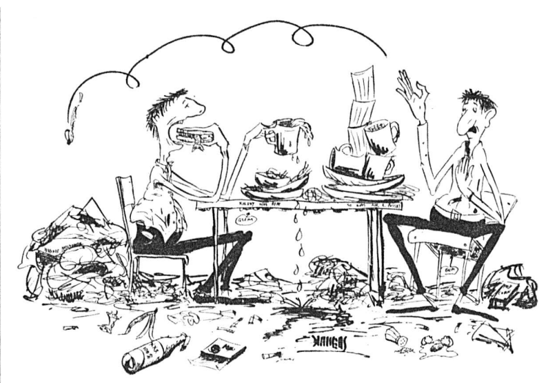
I HATE EATING IN THESE CAFETERIAS—THEY'RE SO DAMN MESSY

A bit of responsibility would help. Let's leave the tables clean, and carry those dirty dishes out like we're supposed to.