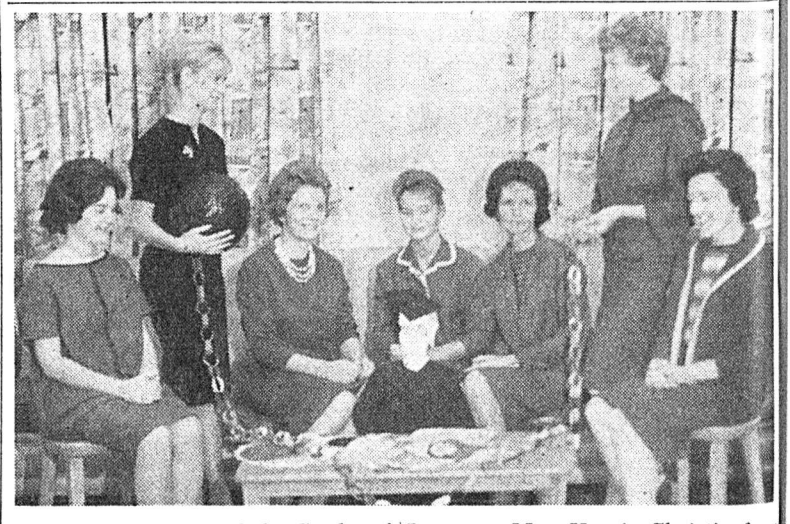
Wives Club will be held Tuesday, October 23 at 8 p.m. in Wauneita guest speaker.