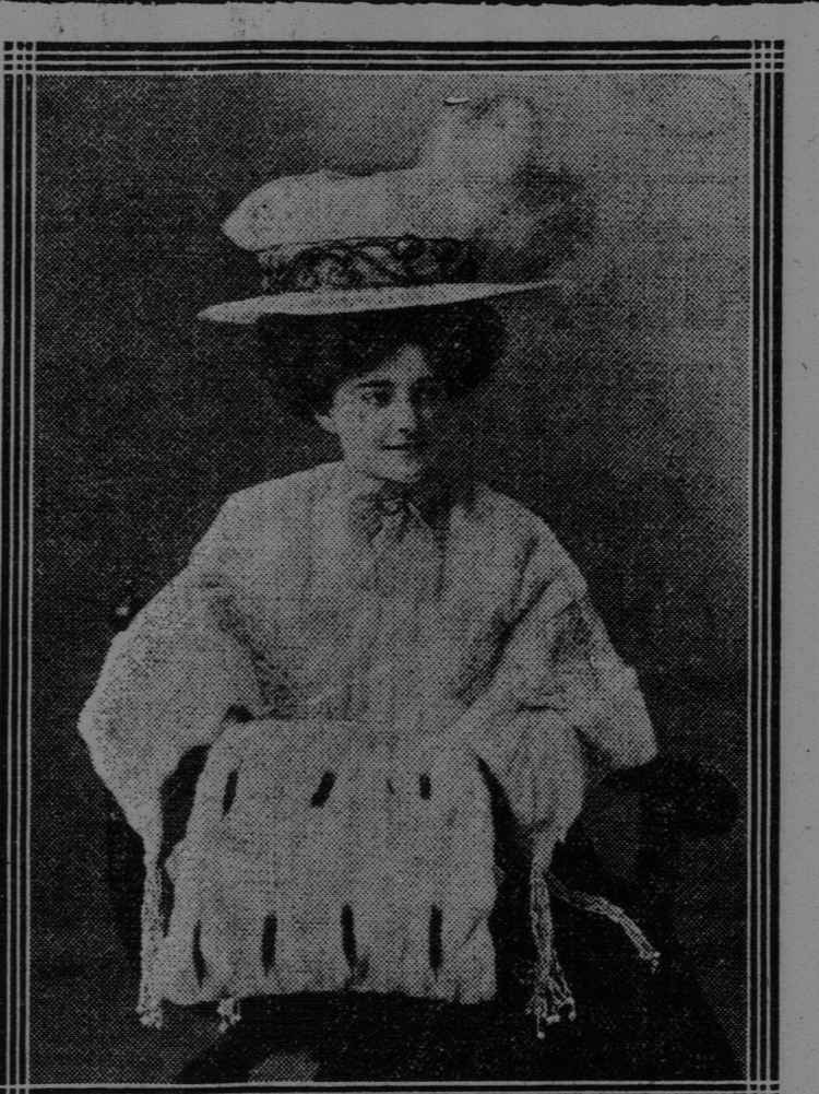
A CHARMING WRAP FOR A DEBUTANTE. Girlishly dainty, yet suitable for maid or matron, is this lovely fur set of ermine. The cape, which is pure white without the little black animal tails, is trimmed with an insertion of the Irish lace.