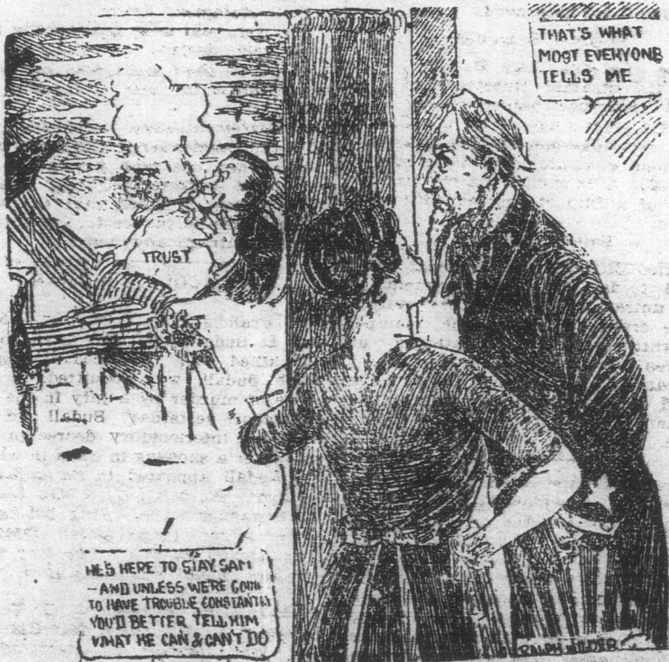
Chicago Record-Heral HOW IT LOOKS TO UNCLE SAM.