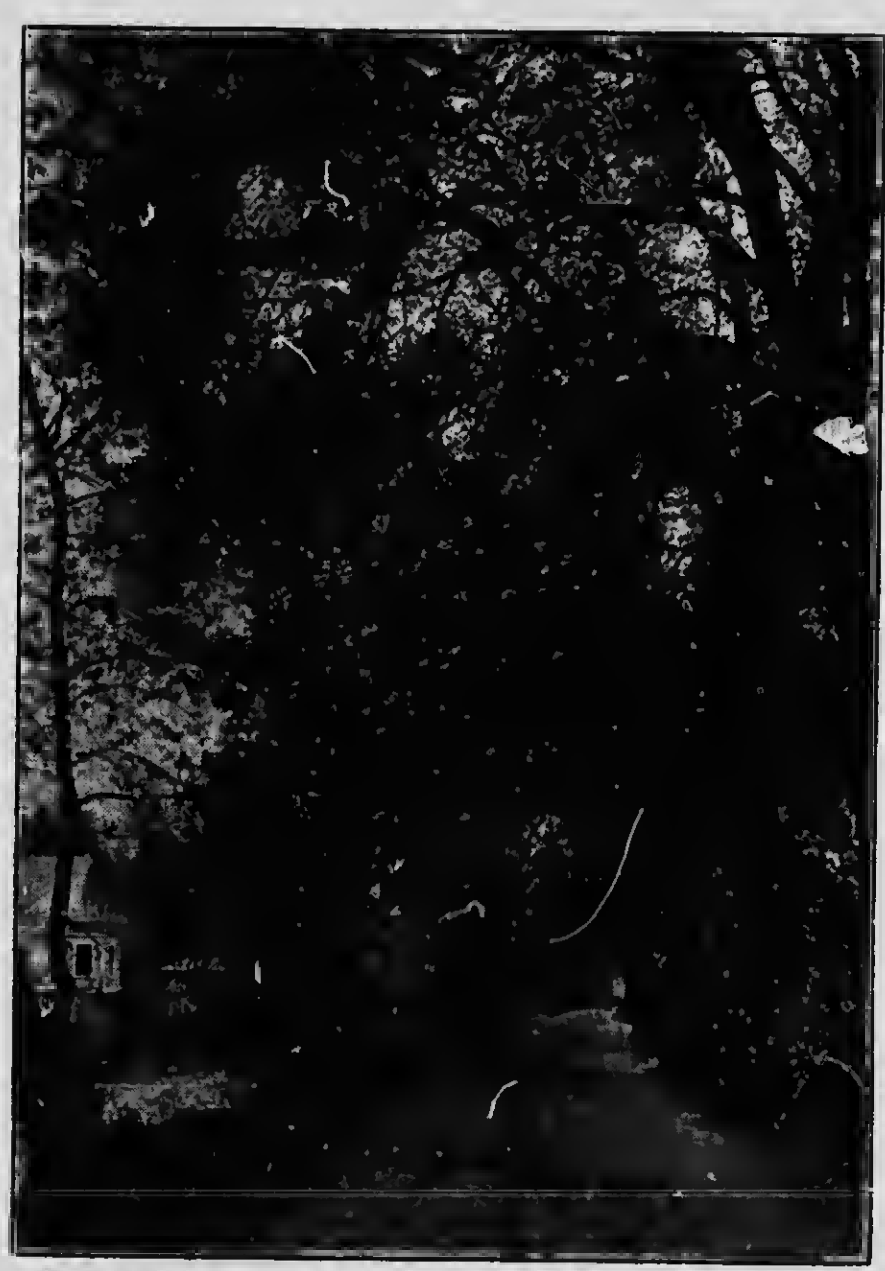
A Highway in the Annapolis Valley. See page 57.