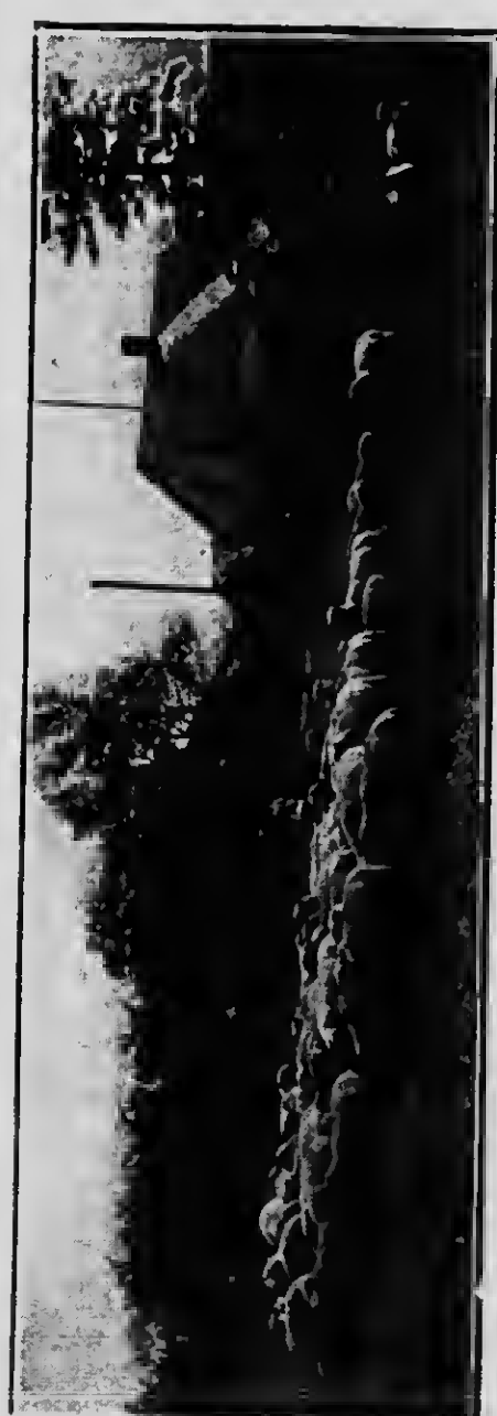
Nova Scotia is peculiarly adapted for sheep-raising. See page 21,