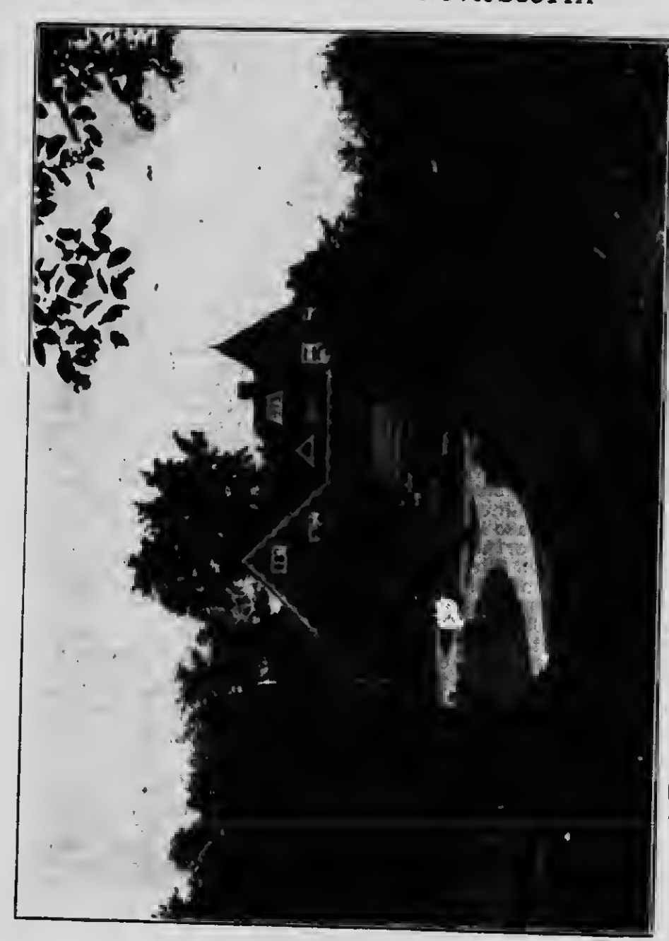
See Fruit Growing, pages 17-19. A Fruit Farmer's Home.