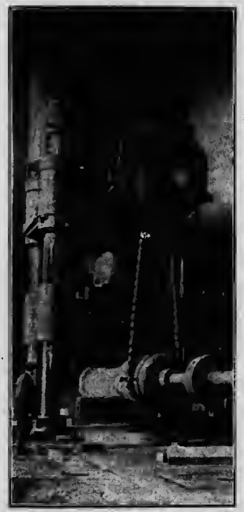
The Largest Forging Press in Canada at the plant of the Nova Scotia Steel & Coal Co., Ltd., New Glasgow, N.S.

The Natural Centre of Nova Scotia for Manufacturing and Distributing