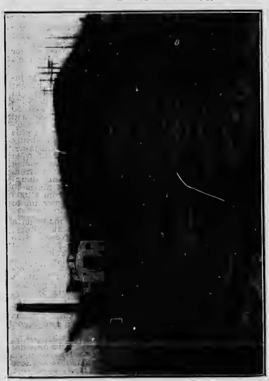
Lumbermill and Sawmill. See Forests, page 6.