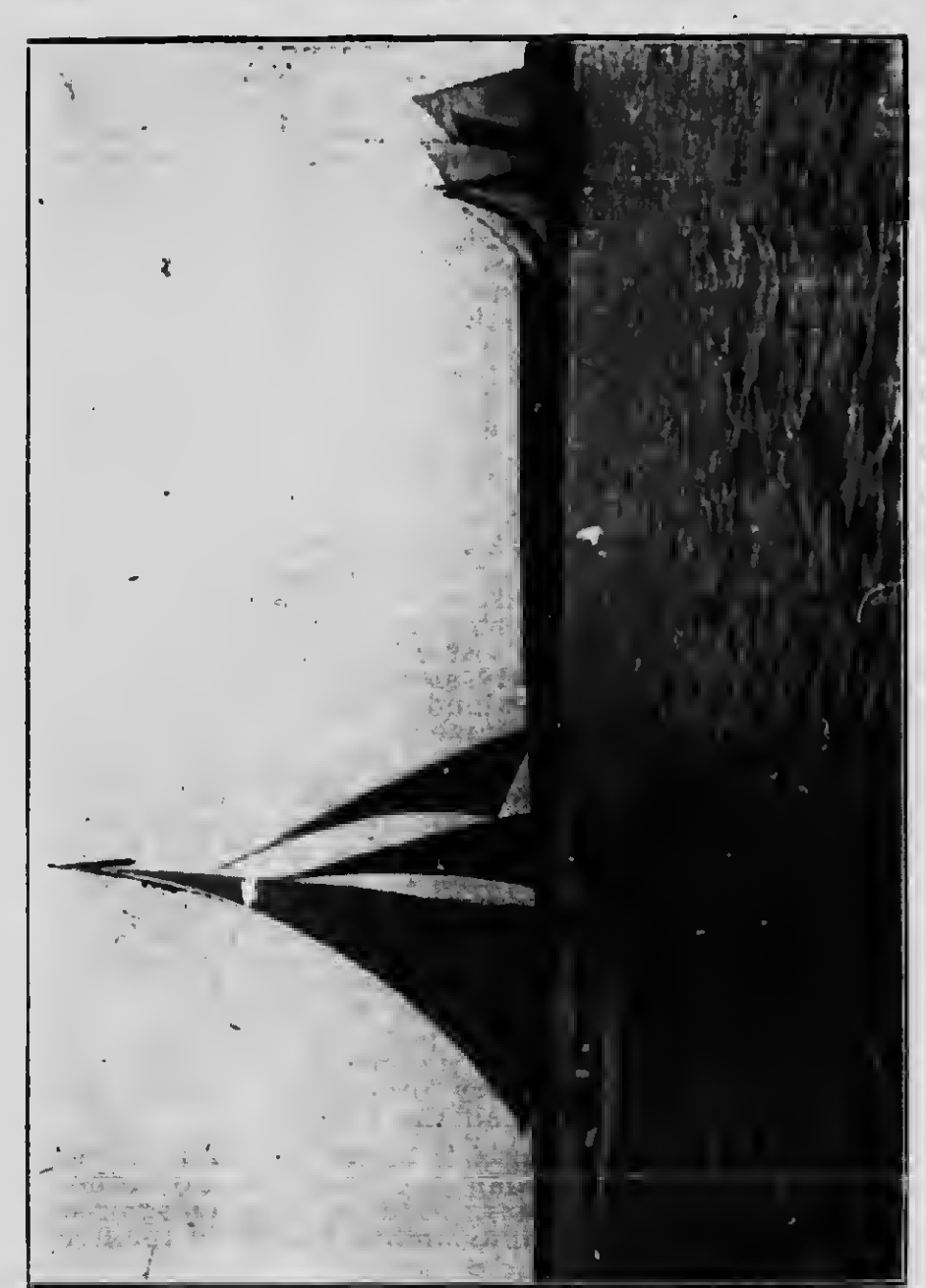
See Fisheries, pages 22-25. Off to the Halibut Grounds.