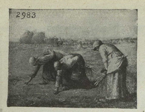
"The Gleaners" - Millet

We can supply a nice sepia copy of this picture for $1.00, in a size suitable for schools, as well as many other appropriate subjects