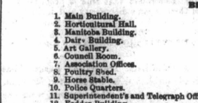
Man's Eye View of the Ottawa Exhibition Grounds.