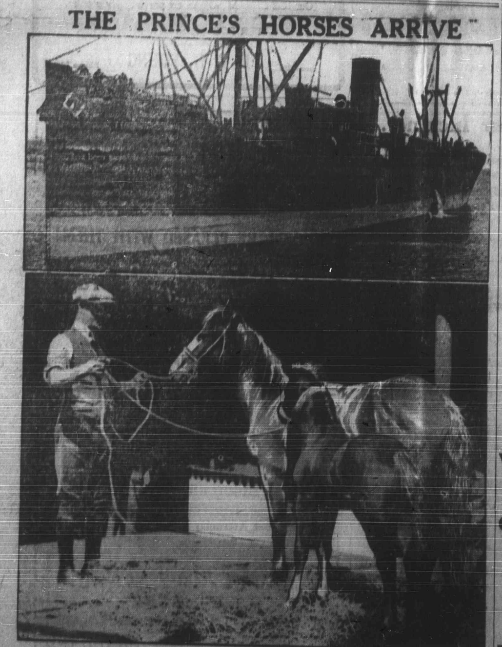
arriving at Montreal, having on board horses and ponies for the