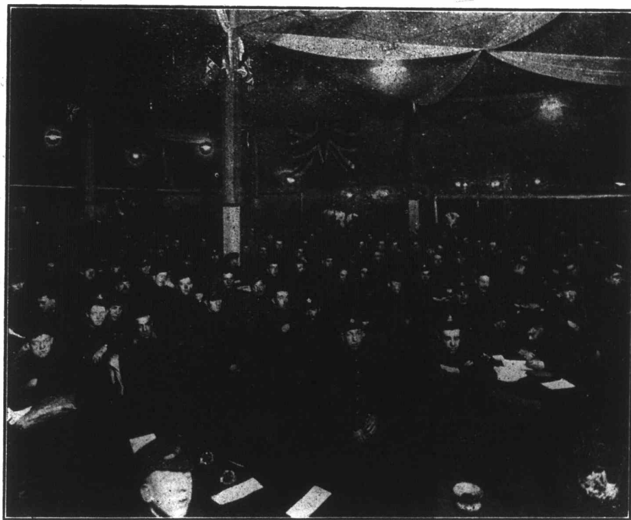
Canadian Soldiers in Y.M.C.A. Camp, Bramshott.

That he was fearless before men goes without saying—fearless to the highest summit of heroism.