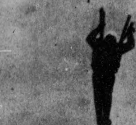
Pictured here is one of the many competitors in the Winter Carnival Para-jump competition. Jumpers from many parts of Canada and the United States dropped in for the occasion. Himpared only on Saturday by snowfalls, and bothered by a low ceiling on Sunday, the exhibition provided thousands of carnival goers with thrills throughout the three-day event.