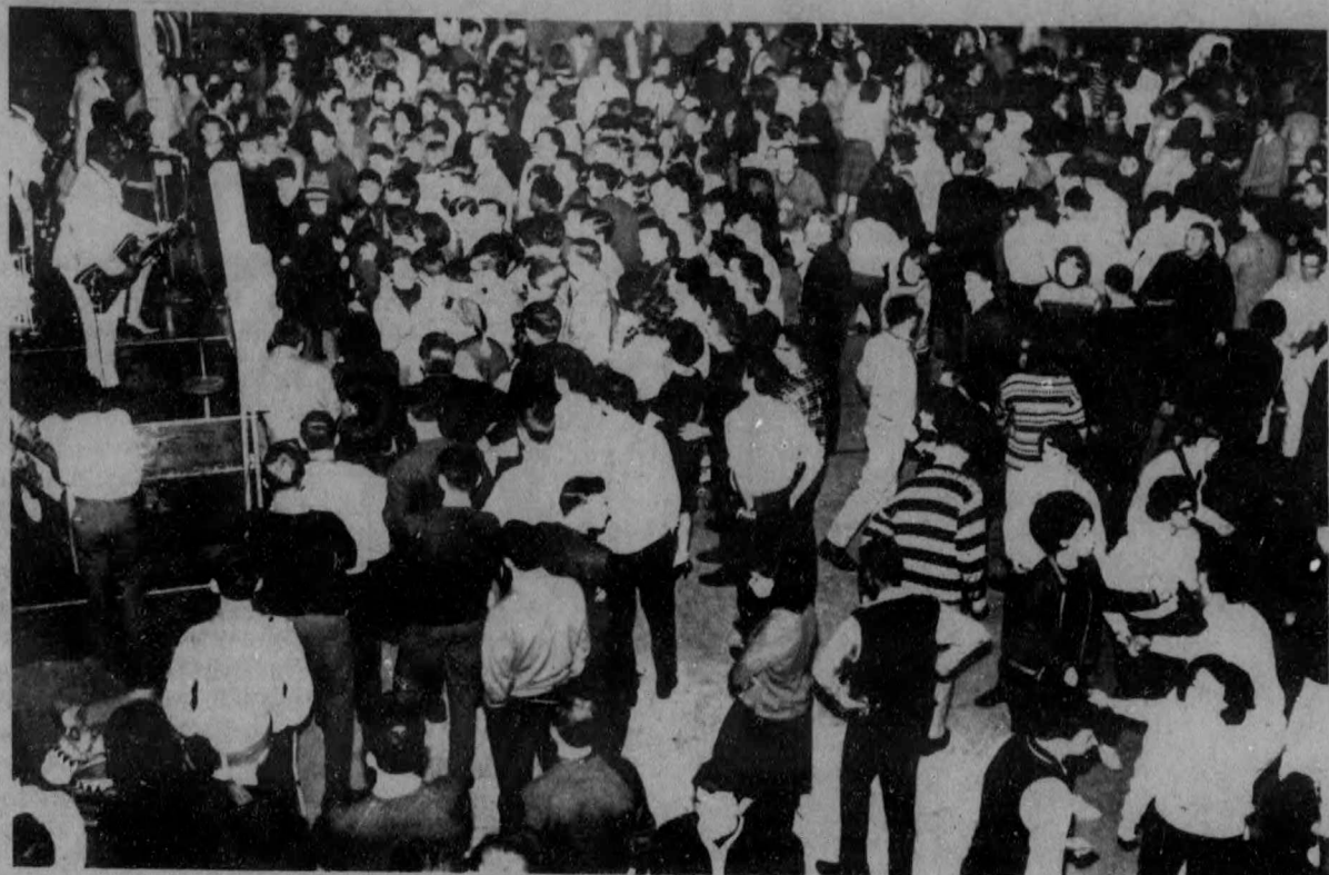
"Hay, Bo Diddley" was the cheer that echoed in the gym last week at the two dances

where Bo Diddley and his band played while people stomped. The only complaint at his