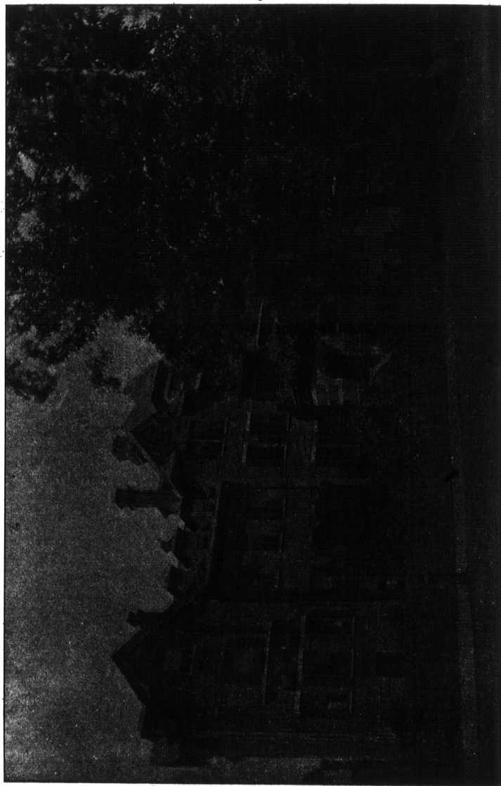
Protestant Orphans' Home, Dovercourt Road, Toronto.