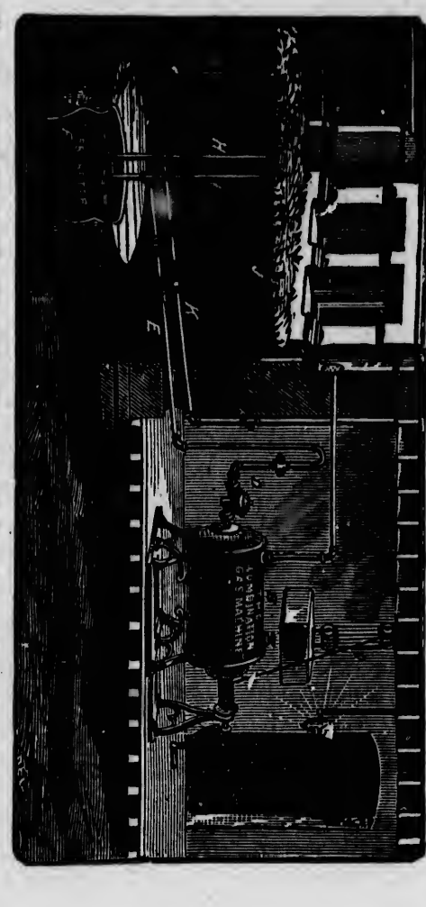
The above cut shows the Combination Gas Machine in position, ready for use.

further investigation, with a view to purchasing. begoes that after perusing its pages, you will get sufficiently interested in the subject of CHEAP LIGH1 as to warrant you in making If, however, you want nothing of the kind, we will esteem it a great favor if you will hand this book to some FRIEND who will PLEASE NOTE.—This pamphlet is published for the purpose of advertising our GAS MACHINE, and we send it to you in