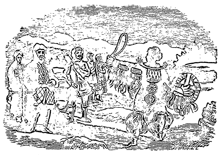
Calmuc Shaman Priest. A Samoyede. Woman. Tartar.