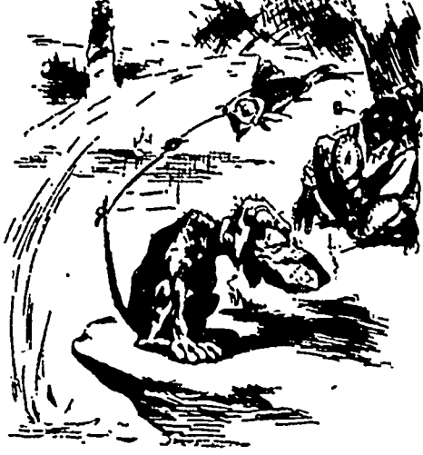
2. "Pull 'im in!"