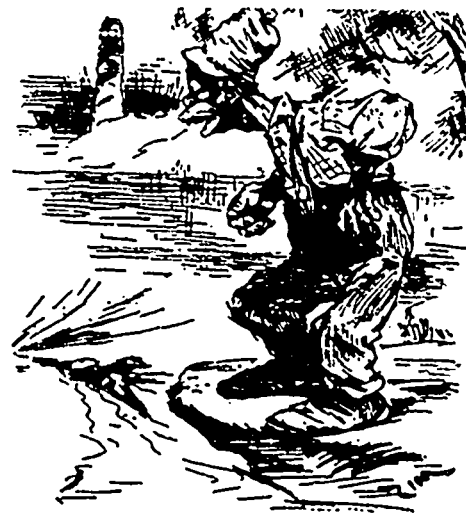
4. "Gracious me! that must 'ave been a dawg fish!"