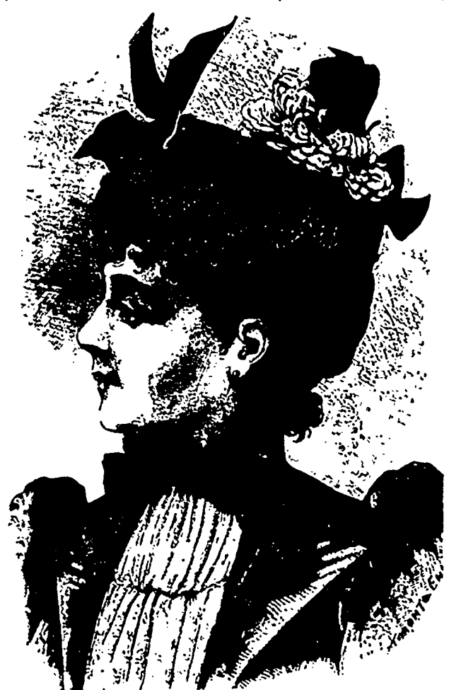
PLATE NO. 1.—Toque of black chip having brim draped with jet and pearl, bows of black velvet ribbon back and front, with a chaplet of mais shade of roses set at top of crown at back, with projecting heads of large jet pins. Strings of black velvet.

Dame fashion, says the Millinery Trade Review, rarely reaches her extremes by a sudden bound, but by easy stages. Carefully considering their acceptance or possible popularity, her designs are subject to a deliberate course of evolution, and she is slow in arriv-