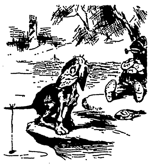
3. ' Woll done! try again."/