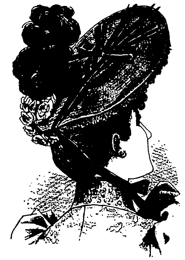
PLATE No. 2. A very Frenchy hat is here represented which is almost crownless and widely flared in front. The brim is faced with lace, and the outside trimmed with black ostrich tips, yellow or red flowers. The illustration plainly shows the manner of trimming.

As in New York, this is essentially a season for artifical flowers in Paris. Many of the small bonnets are objectively made of flowers, and many little bonnets are no more than frames lightly and loosely covered with plain or dotted tulle or lace, with a bunch of flowers supported by a bow of lace or ribbon upreared at the back, and strings of lace or ribbon set at the back.