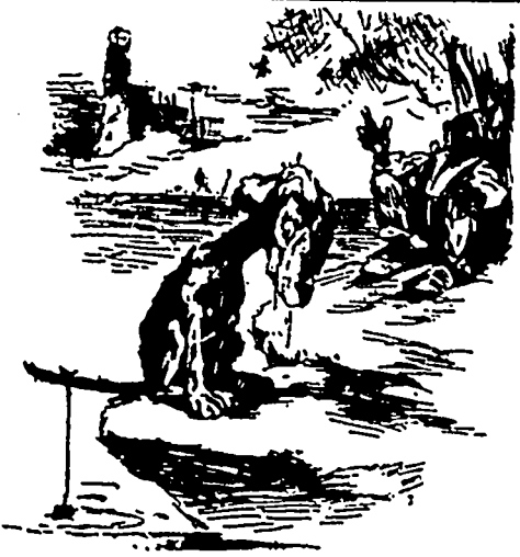
1. "Mind, dah! Brutus."