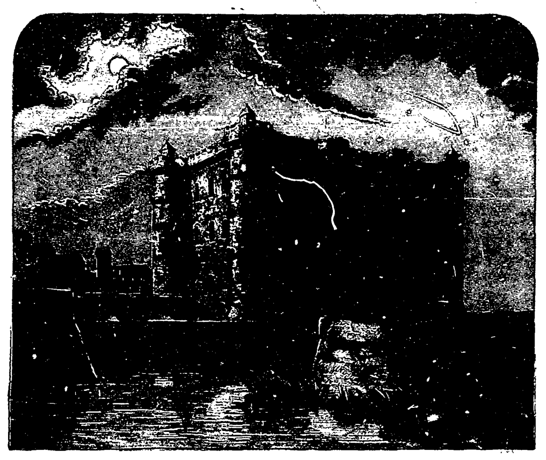
THE OLD BASTILE.

But there is another species of martyrdom which must ever be a subject of deep regret to those who are thoroughly alive to the principles of Jesus, which taught "on earth peace, good will towards men," and that is the martyrdom which came from Christian to Christian. That Christianity itself should have ever so far drifted from its own position of true liberality and love, as to imprison and torture, and put to death her own members, is a subject indeed of the greatest regret. Yet history holds up the unwelcome picture to ou: eyes and reveals to us too plainly the naturally intolerant qualities that exist in mankind.