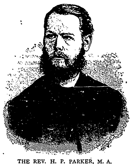
Bishop-Designate of Eastern Equatoria. Airica.

Venice has its Bridge of Sighs and its old political dungeons, England has its Tower of London with many savage emblems of days happily gone by, and it is hoped forever, but Paris has torn down its Bastile. Pictures only of it remain. Its