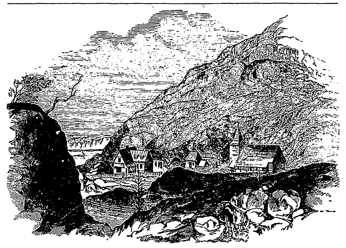
A SCENE IN NEWFOUNDLAND.

sent home with a number of diseased seamen, but the commander, who was on board the "Squirrel," went down in her with all the crew in a fearful gale. Prior to this sad loss, when in great danger, the noble hearted man gave utterance to the true Christian sentiment "We are as near Heaven by sea as by land."