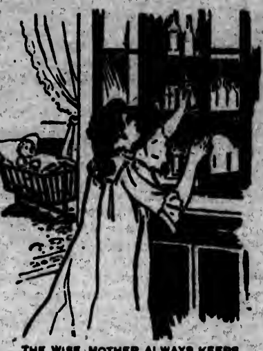
THE WISE MOTHER ALWAYS KEEPS

T doesn't matter where the cold is or how long it has bothered you, Griffiths' Menthol Liniment will reach it and cure it. If it is a cough or cold on the chest, take a few drops internally on sugar or in water. and rub the throat and chest thoroughly with the liniment. If it is a sore throat or quinsy. gargle the throat with the liniment and rub plenty on the outside; the soreness will disappear in a few minutes. If it is croup, whooping cough, or la grippe, use it internally and externally. Griffiths' Menthol Liniment is the only remedy that will give