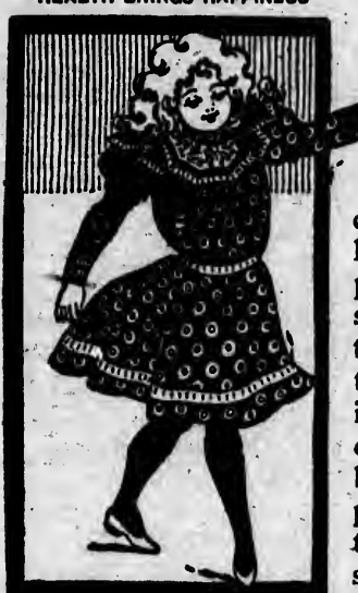
DR. COWAN'S SYSTEM CLEANSER BRINGS HEALTH.

attending to your stomach troubles. It cures constipation, indigestion, biliousness, dyspepsia and all liver and kidney troubles. It is a perfect tonic and blood purifier. Dr. Cowan's System Cleanser is not a cathartic, but