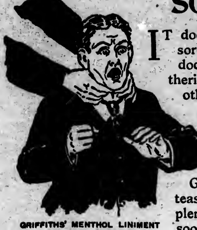
TOUCHES THE SPOT.

lief. It is also simply wonderful for pains on the chest or in the back, a cough or cold, croup, whooping cough, etc. It is much safer and more pleasant to use than cough syrup. It breaks up a cold in less time than any other remedy ever known, trial will convince you. 25 and 75 cents.