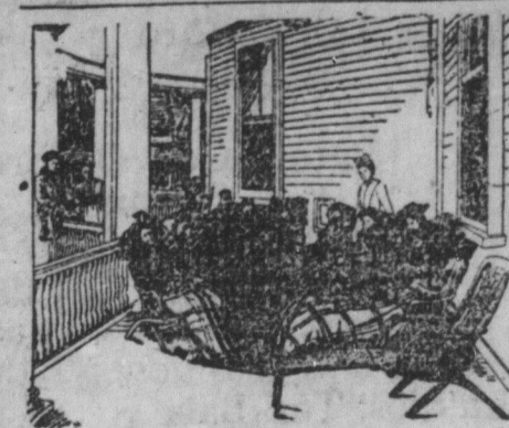
TAKING THE CURE IN WINTER AT MUSKOKA FREE HOSPITAL FOR CONSUMPTIVES.