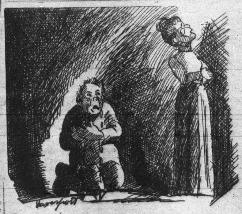
"COME BACK TO ME SWEETHEART, AND LOVE ME AS BEFORE."

If the mayor and city council have During the first verse I kept my decided to act favorably on the ap-