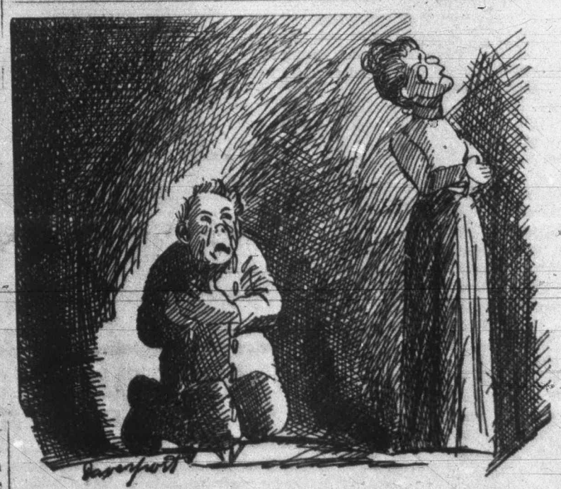
"COME BACK TO ME SWEETHEART, AND LOVE ME AS BEFORE."

If the mayor and city council have During the first verse I kept my decided to act favorably on the ap-