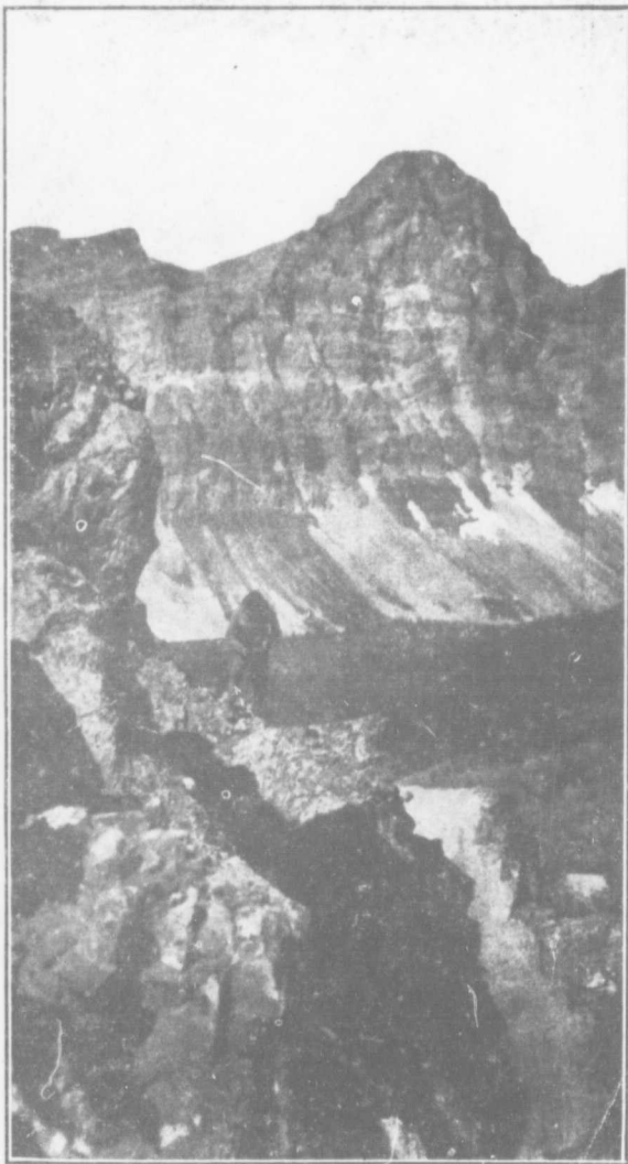
Photo Taken From Top of Trinity Mountain—9870 Feet. Mt. Dunn, 10,000 Feet, in Background