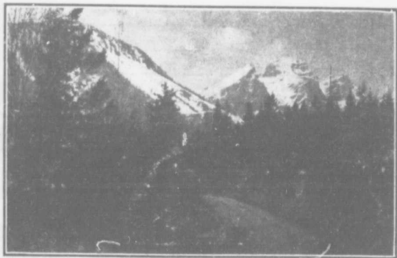
MOTOR ROAD IN FERNIE.

The Scenic Wonderland of the Canadian Rockies