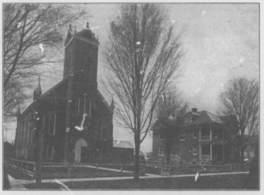
CORRIE METHODIST CHURCH AND PARSONAGE