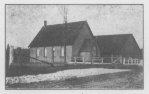
ORANGE HILL CHURCH