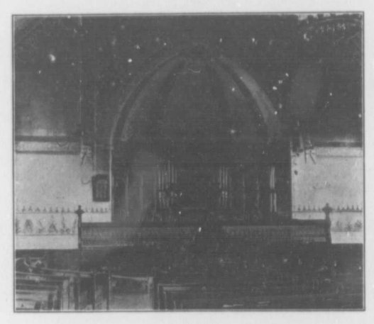
INTERIOR VIEW OF GORRIE METHODIST CHURCH.