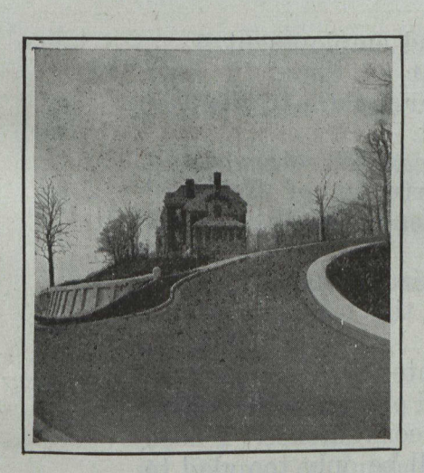
Road in West Crescent Heights, West-mount, a suburb of Montreal. Treated with "Tarvia-B."

Cedar Street South, Kitchener, Ont. Tarvia Modern Pavement constructed in 1912.