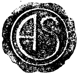
The Sign of Absolute Satisfaction or your money back.

◆◆◆ Miniature Medals, Orders and Decorations.