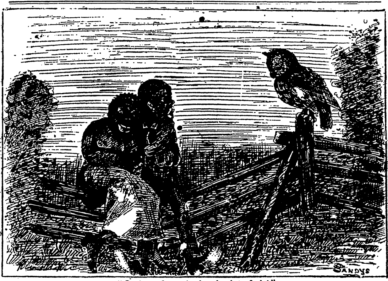
"Go 'way from dar! ye're interferin'."