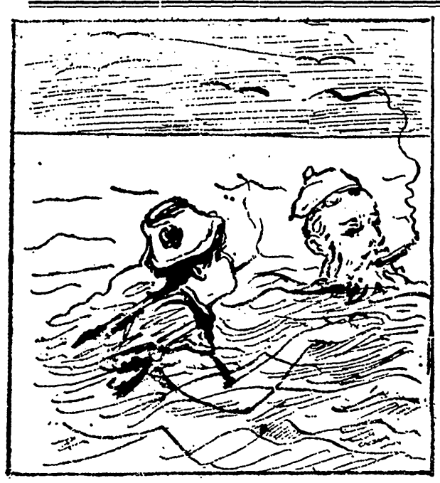
A Smoking Hot Day.