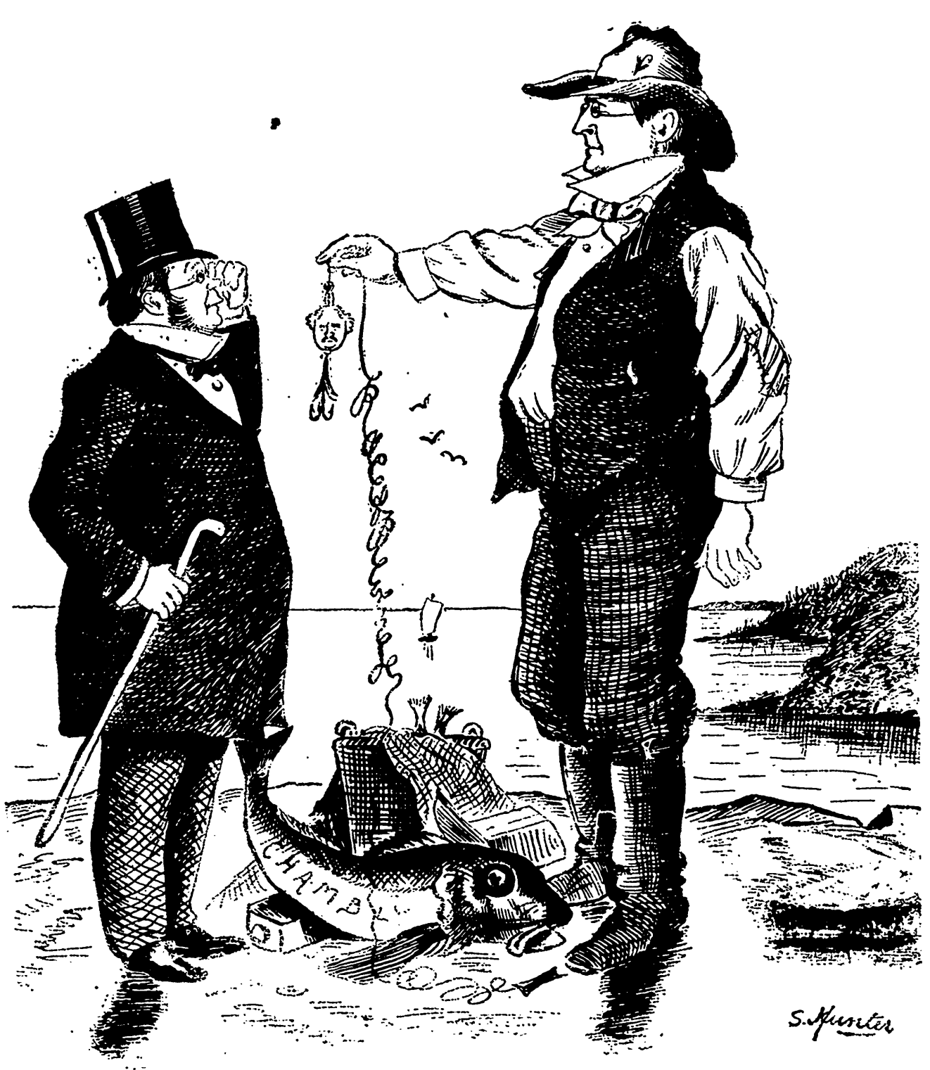
. THE RACE AND REVENGE SPOON-A RIEL GOOD BAIT.