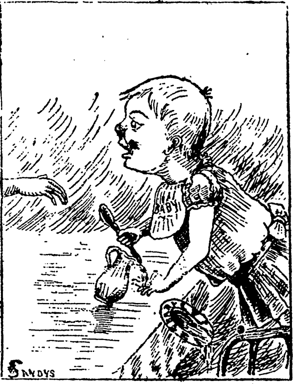
The Autocrat of the Breakfast Table.

How can a pig always build his own dwelling-place? By tying a knot in his tail, which will be a "pig's tie" was all young Oberly needed to put him at ease in the (pig-sty).