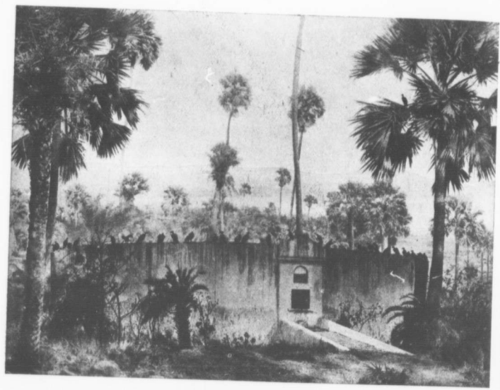
A PARSEE TOWER OF SILENCE