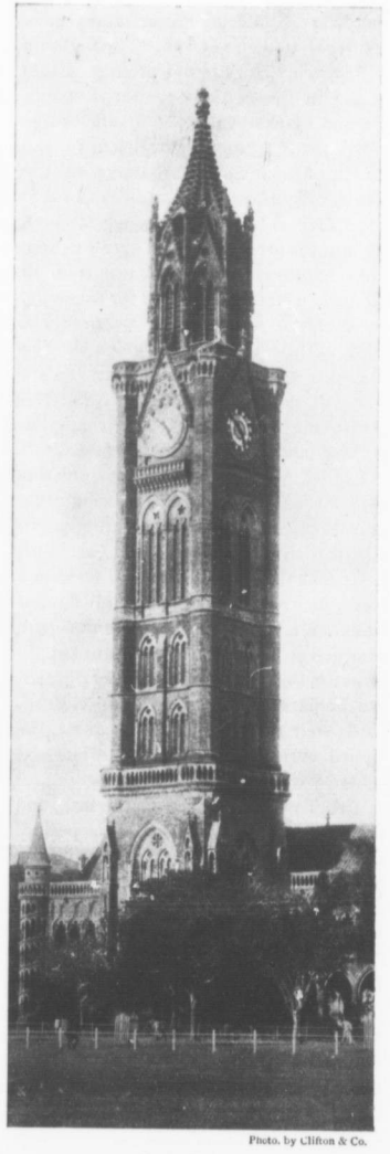
CLOCK TOWER. BOMBAY.

I know a man who made up his mind to assure his life-next year-and then forgot all about it. Strange to relate, he said it was five years before that thought came to him again. It came to him along with diabetes, but his chance for life assurance was gone. - Amicus.