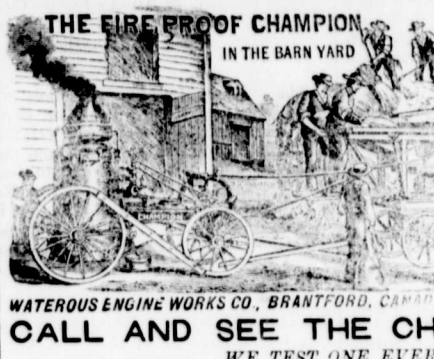
THE FIRE PROOF CHAMPION IN THE BARN YARD

THE IMPERIAL HARVESTER. EQUIPPED WITH OUR NEW RAKE. When we tell you the Imperial Harvester is the most perfect reaping machine made, we also lay before you the facts in order that you can judge for yourselves.