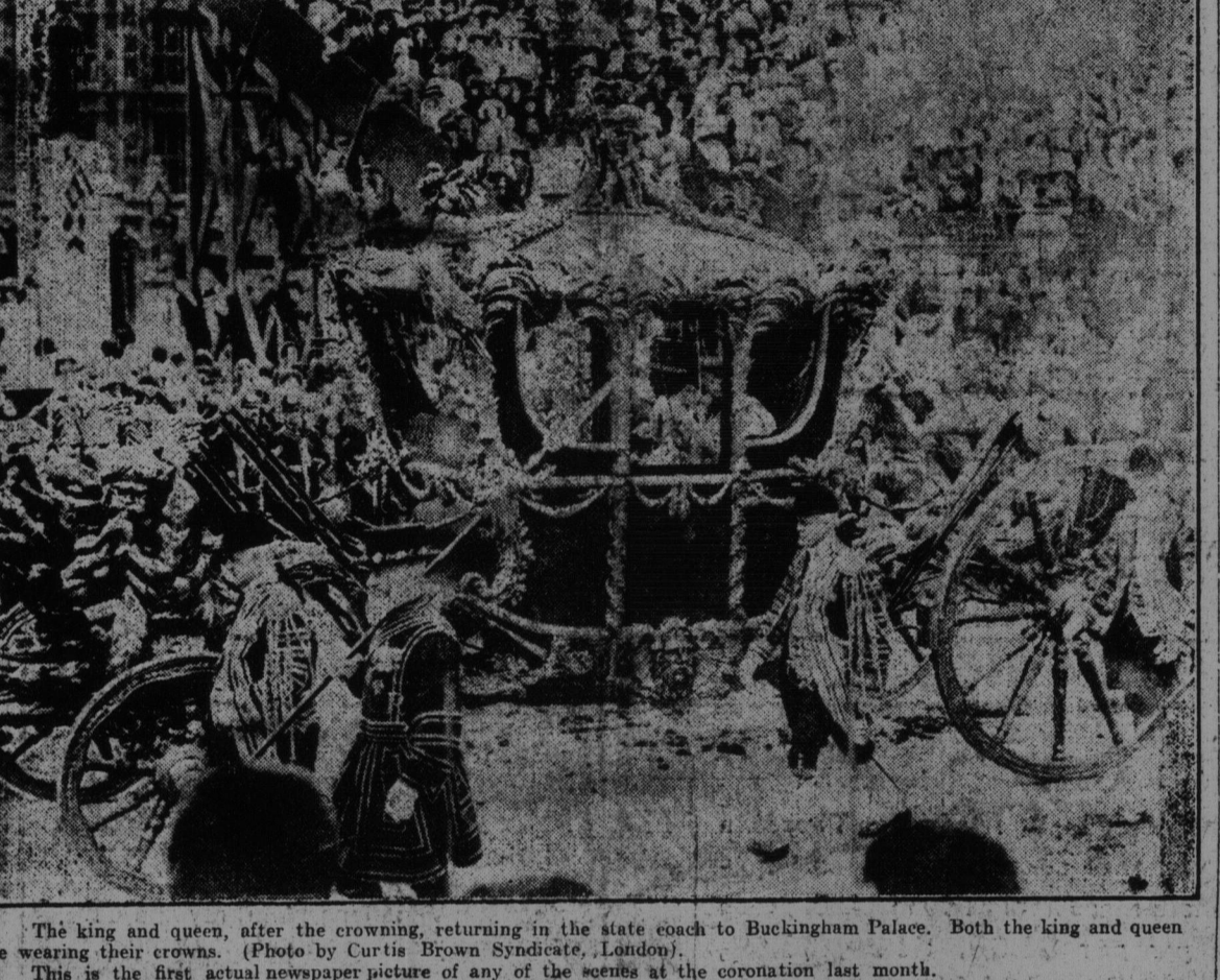
The king and queen, after the crowning, returning in the state coach to Buckingham Palace. Both the king and queen are wearing their crowns. This is the first actual newspaper picture of any of the scenes at the coronation last month.

PORCUPINE WOOD FIRES ARE SERIOUS May Have Been Loss of Life—Hon. Frank Cochrane Had an Exciting Experience in Escaping From the Flames