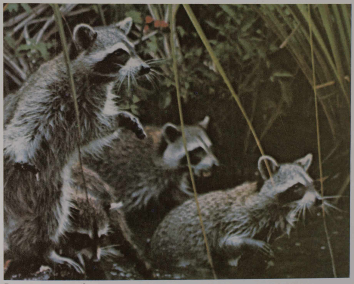
Raccoons — see page 8