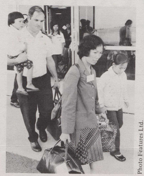
A member of the Canadian Forces helps a refugee family on their arrival.

legislation introduces a mechanism for federal-provincial consultations on future immigration levels, and for the annual announcement in Parliament of future intake. This planning process includes a projection of the sources and numbers of refugees which Canada expects to resettle in a given time period.