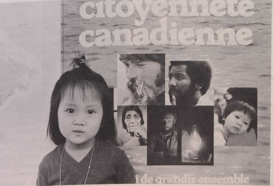
A young Indochinese girl stands in front of a poster on Canadian citizenship.

First, refugees are now a separate immigrant class and are not subject to the same selection criteria as other immigrants. Second, the act provides for the private sponsorship of refugees in addition to those who are resettled by the Federal Government. And finally, the