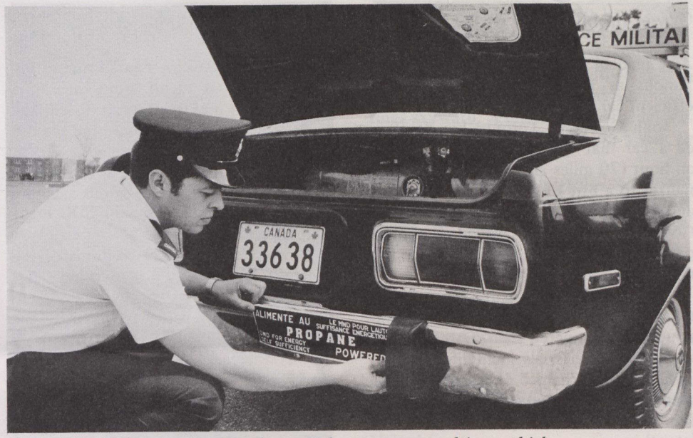
A Canadian Forces serviceman places sticker on propane-driven vehicle.

Cost of converting each vehicle ranges from $1,200 to $1,500, but the military expects lower fuel costs to make up for that in less than 18 months. Conversion involves changing the fuel tank and the