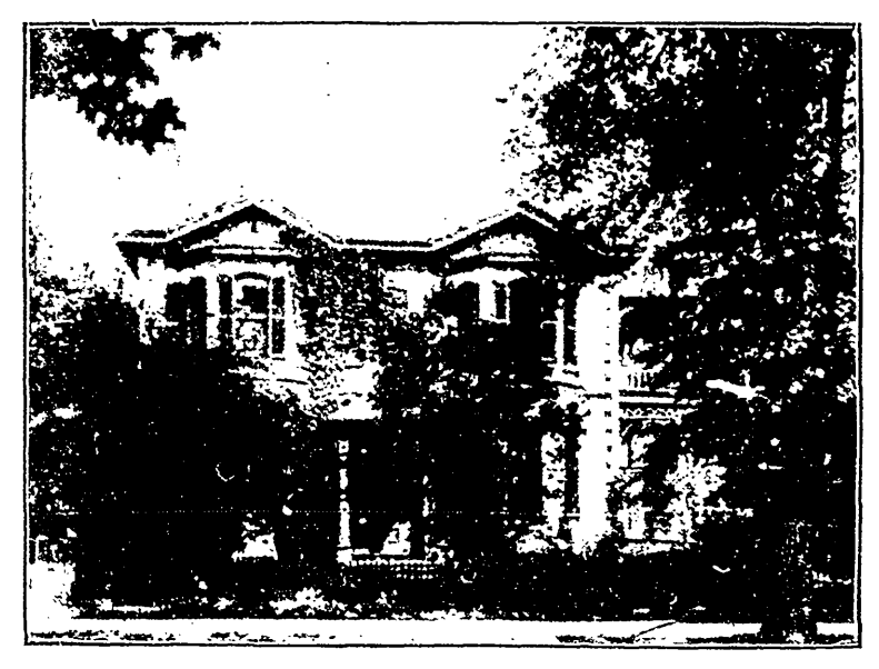
NEW MEDICAL LIBRARY, QUEEN'S PARK, TORONTO.

more systematized, the observations more certain, and the results better noted. Unfortunately there are but few in a city and less in the country. . . . who can utilize it. Medical societies are valuable means of education, fostering and encouraging thought. But they have their drawbacks—the stated meetings that one is unable to attend; the subject that one is obliged to listen to in which he is not interested; the idle and empty discussions from which there is no escape even in the best societies, etc. There is but one grand institution that stands above all, that has