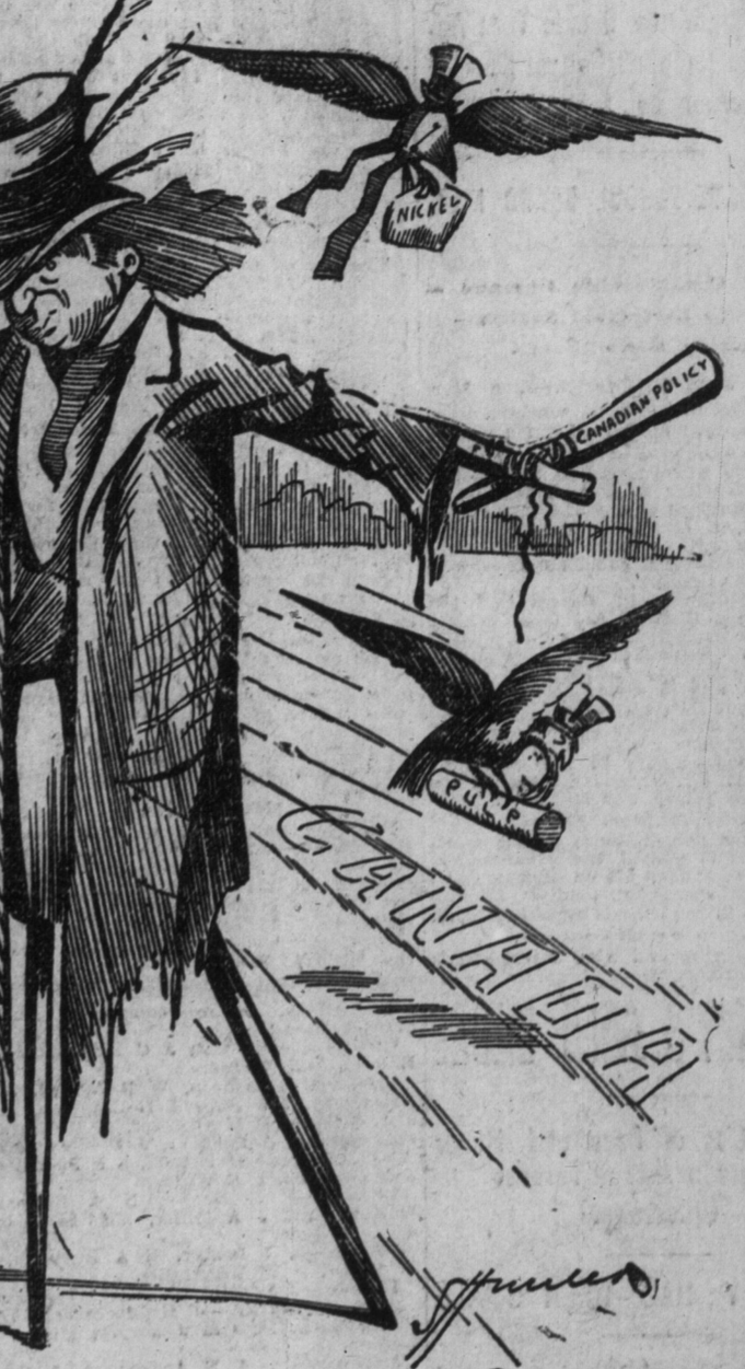
But the alien crows don't seem to be very badly frightened.