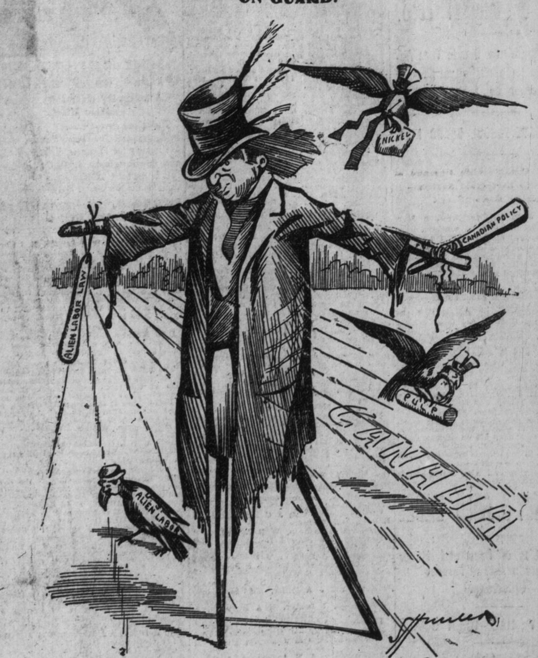
But the alien crows don't seem to be very badly frightened.

Monuments and Plumber's Marble-nest-nest. The Queen City Granite Co., Limited, 45 Queen St. East. Pink of Perfection. The dainty bride and her bridesmaids must have the prettiest and sweetest of flowers for the June wedding. If intending bridesmaids will send their orders at once, they will have the very best flowers and bouquets, made in good style. Salesrooms, 5 King west, 445 Yonge-street.