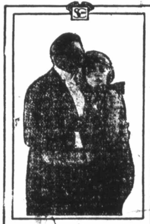
HAROLD LOCKWOOD in "SHADOWS OF SUSPICION"