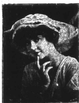
MARY MILES MINTER

Pathe presents the darling of the screen in a photoplay of comedy, love and adventure. It is a photoplay that you have the good fortune to see once in a while. You will like it, we'll guarantee that