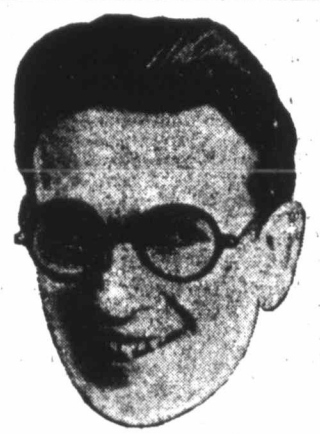
Harold Lloyd HAPPY HOUR—THURS.

You can get Dr. Williams' Pink Pills through any dealer in medicine, or by mail, post paid, at 50 cents a box or six boxes for $2.50 from The Dr. Williams' Medicine Co., Brockville, Ont.