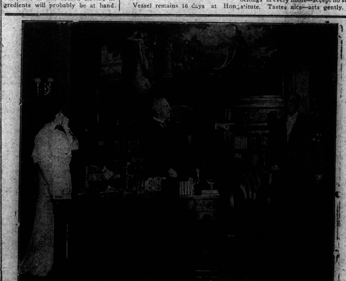
Scene from "The Gamblers," at the Grand, Thursday, January 9.

mixture and placed in a well-buttered, and will proceed via Suez, Colombo, Take this wonderful Compound Penang, Singapore, Hong Kong, as directed with the knowledge that After the tomatoes are placed in Shanghai, Nagasaki, Kobe, Yoko- there is nothing else in the world. the pan they may be improved by hama and arrive at Vancouver Sat- which will cure your cold or end sprinkling with cracker crumbs mix- urday, June 7th. From Vancouver to Grippe misery as promptly and with-Toronto, passengers may travel via out any other assistance or bad after-Canadian Pacific main line or Crows' enects as a 25-cent package of Pape's Nest Pass line and may also travel Cold Compound which any druggist made with remnants of food left from Fort William or via Great can supply—contains no quinine—over, and at this season all the in-