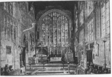
INTERIOR PARISH CHURCH.

Abraham is "the slippered pantaloon." 7. Isaac is "the last scene of all, sans eyes, sans teeth, sans everything."