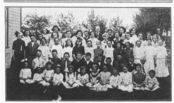
VIRDEN, MANITOBA, HAS A LIVE JUNIOR LEAGUE.

Am I to give up, then, and fail? No, no; I still believe that I am right. In-deed, I know now that these five simple attitudes on the table before me are sym-