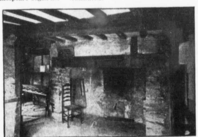
THE LIVING ROOM, SHAKESPEARE'S HOUSE.

Dr. Hall's inscription in Latin is thus translated: