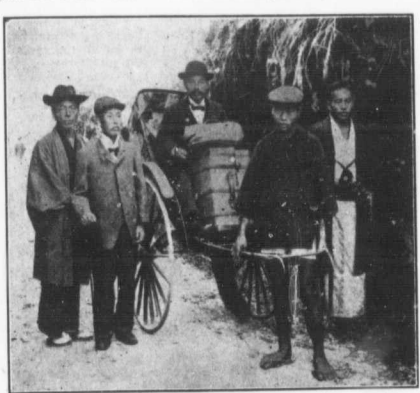
THE JAPANESE GENERAL SECRETARY ON HIS ROUNDS.

It is difficult for one in America to fully appreciate the difficulties of work in For one thing, less than 10,000 Japan. were addressed in all the meetings combined, though nearly the whole year was devoted to this work alone, and thousands of miles were travelled.