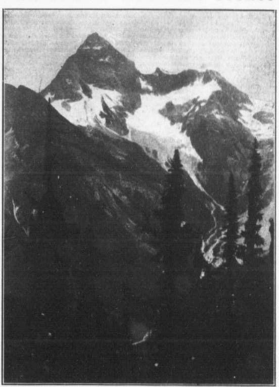
A MOUNTAIN VIEW-SIR DONALD, IN THE CANADIAN ROCKIES

A step— A single step, that freed me from the skirts