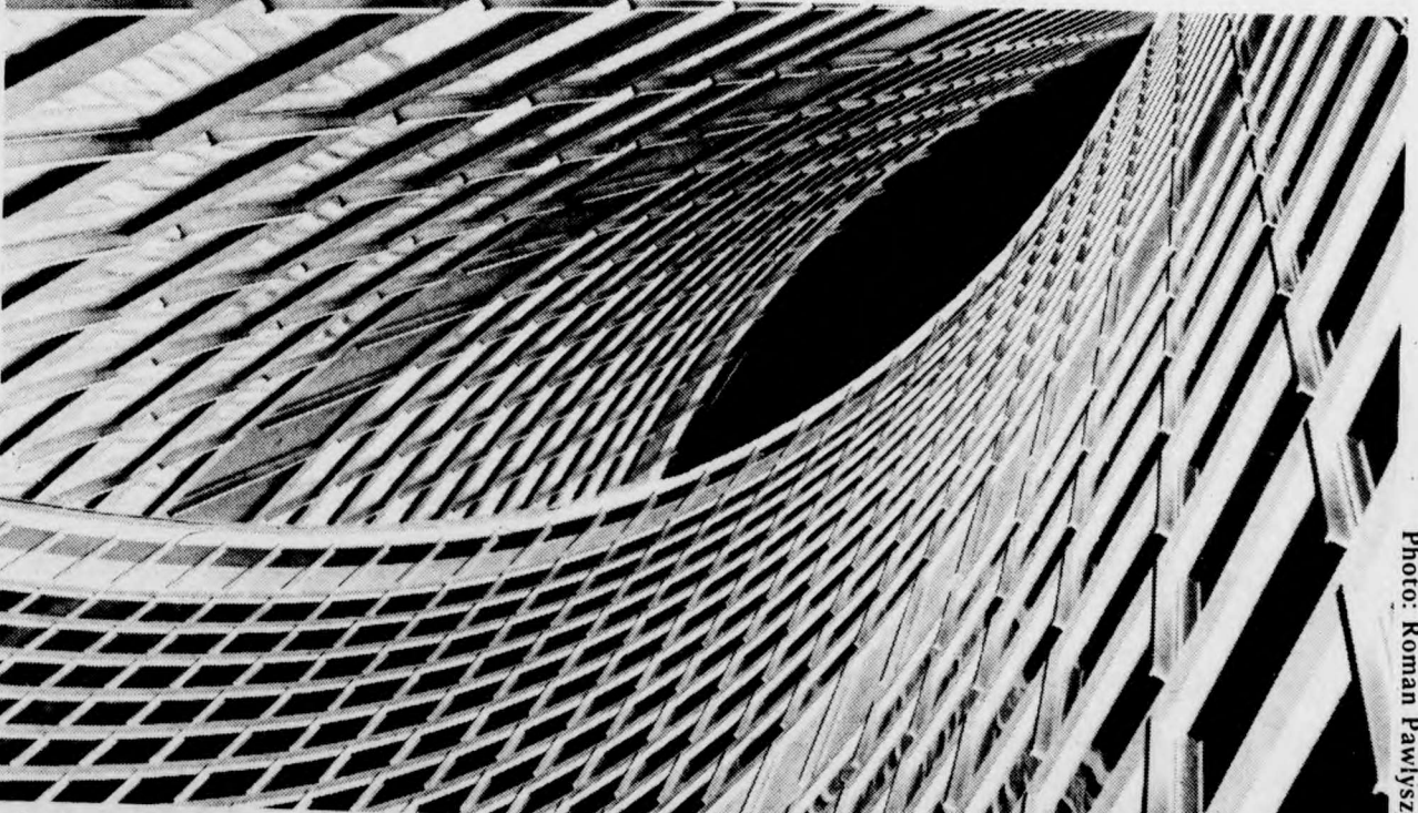
Artist's depiction of a York Faculty of Arts course description catalogue.

Students will be meeting with the administration, and another demonstration has been called for Friday at 1:00 p.m. in front of the President's