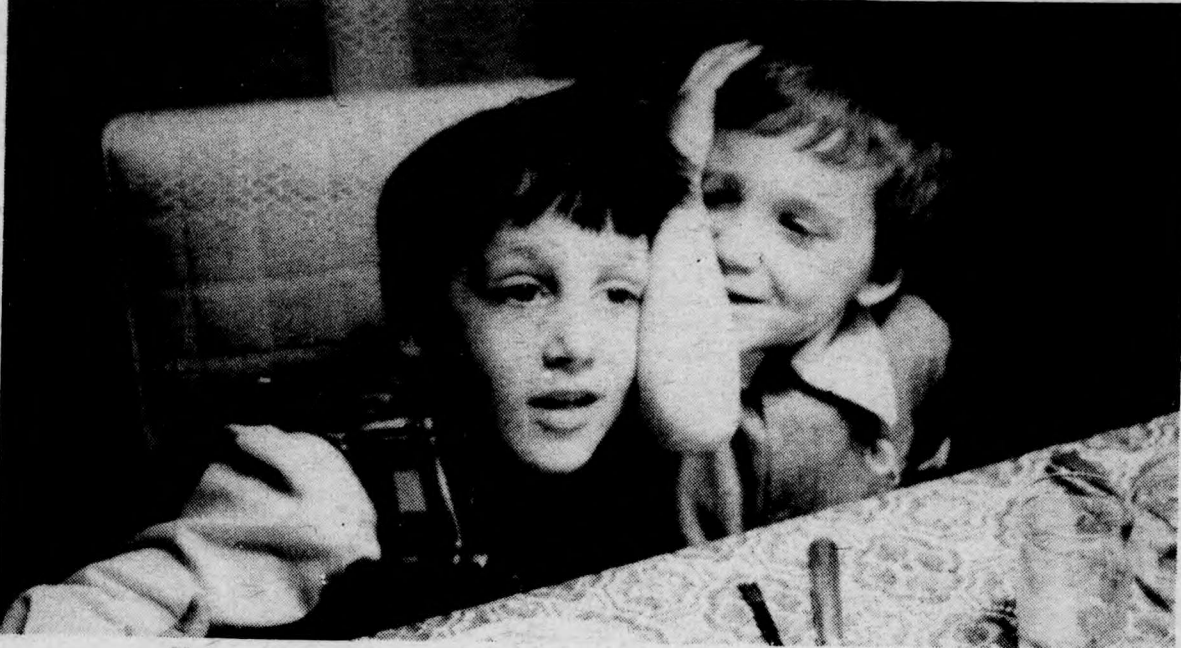
Hey...did you hear this is the last issue of Excalibur ever?