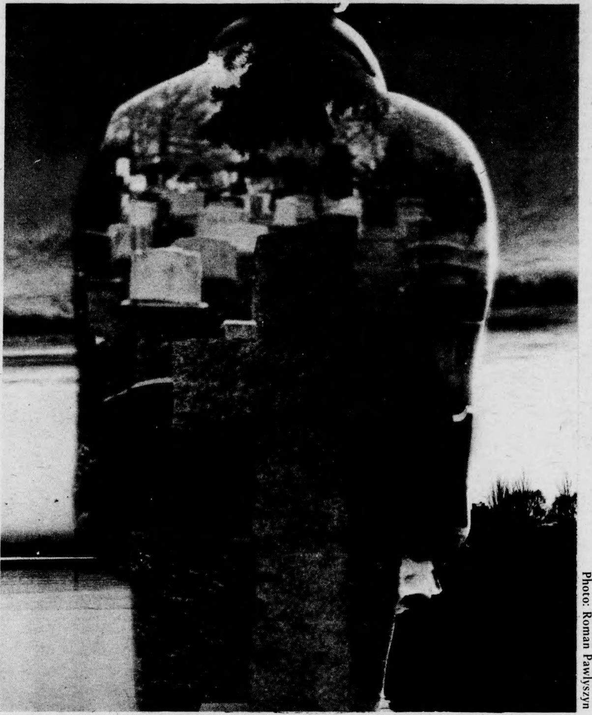
Thousands of York students stand on the brink of exams this week--the grueling ordeal gets underway next week.