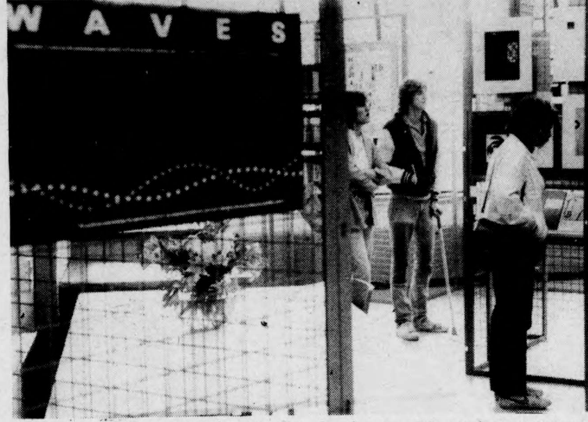
Just one of the many fascinating displays waiting to greet you at Waves, an exhibition of works by the graduating class of graphic design students. Critic J. Brett Abbey says the show has "just the right mix of imagination and skill.

The exhibition can still be seen today and tomorrow, from 10 a.m. to 4 p.m. Works of such a high calibre deserve attention. Waves is a show that will make you think.