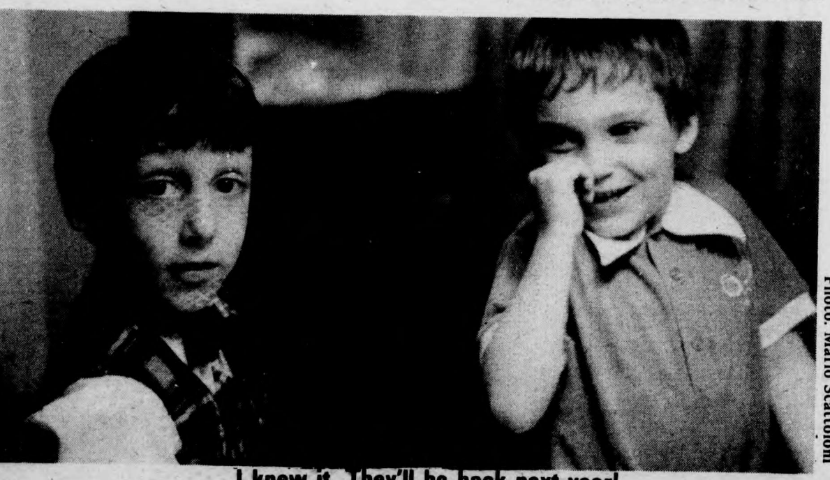
knew it. They'll be back next year!