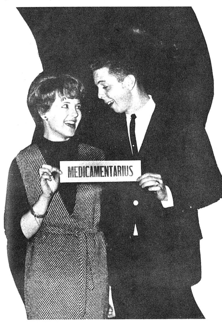
MEDICAMENTARIUS?—Saturday night at the Bromo Ball at least one girl thought she knew. Note her confidence and his overpowering show of knowledge. Medicamentarius-what's that?