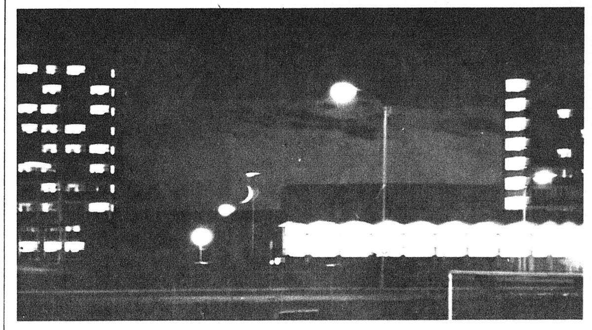
LIGHTS GO ON AT LISTER HALL COMPLEX . . . including the moon, if you can find it

Still none want to live here covered snow balls. One woman permanently. The first snow got carried away and almost convinced them the weather is