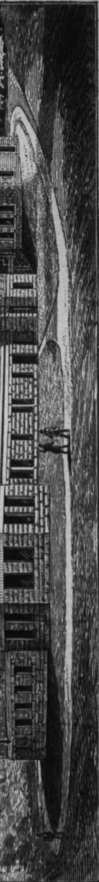
THE DAVID MORRICE HALL AND LIBRARY—PRESBYTERIAN COLLEGE, MONTREAL—(South View.)