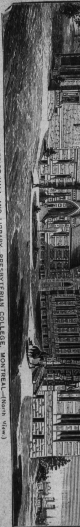
THE DAVID MORRICE HALL AND LIBRARY—PRESBYTERIAN COLLEGE, MONTREAL—(North View.)

N. B.—Bequests of real estate to be valid require to be made at least six months prior to the death of the testator.