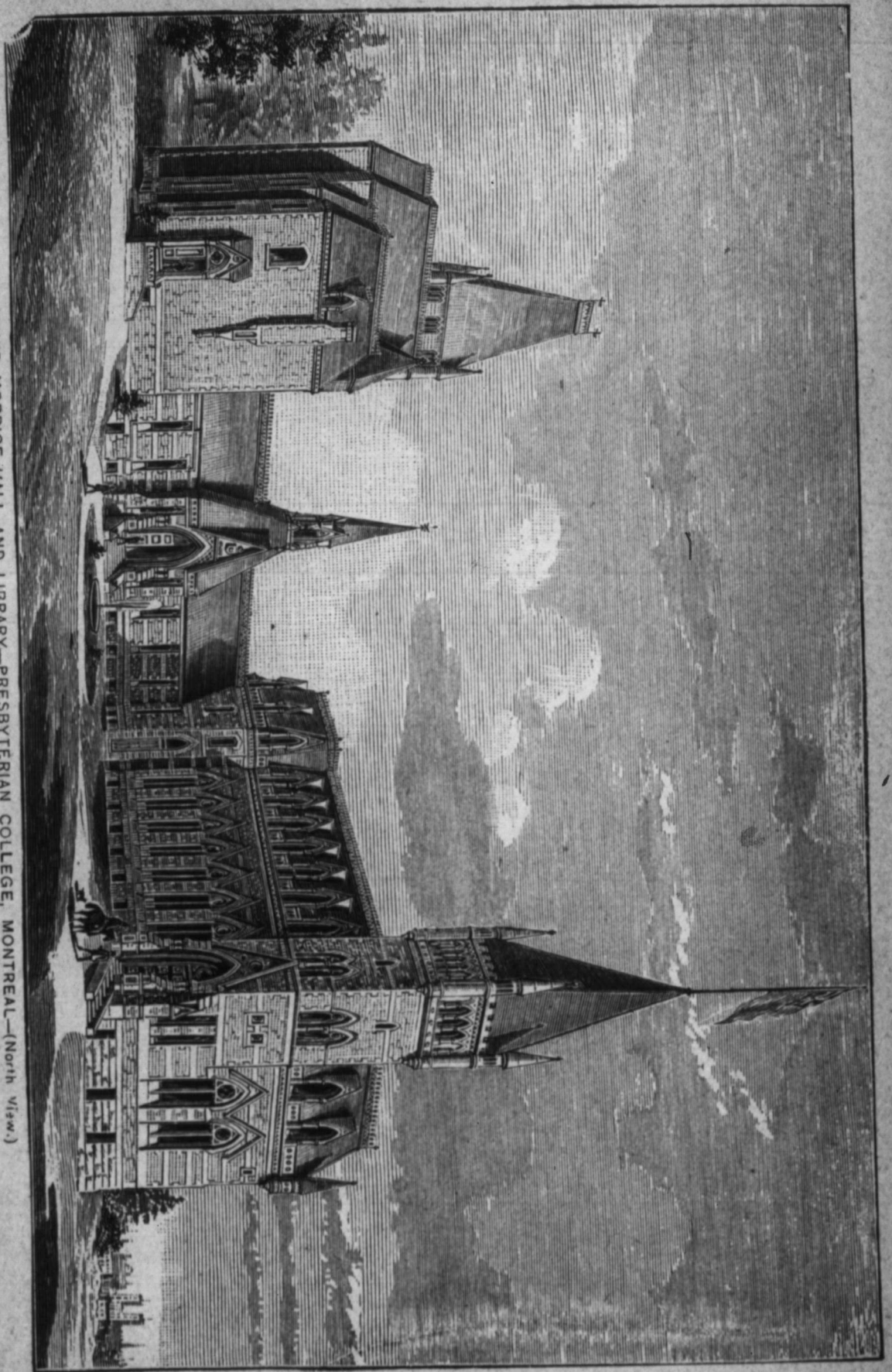
THE DAVID MORRICE HALL AND LIBRARY—PRESBYTERIAN COLLEGE, MONTREAL—(North View.)